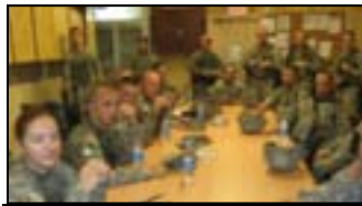
SECFOR conducts an AAR.

But back at the FOB, the work still isn't finished. First, the entire team conducts an After Action Review to determine what they can do better next time. Next, the vehicles are unloaded, cleaned out, and preventative maintenance checks and services are performed on the vehicles to make sure they will be fully operational for the next day's mission.