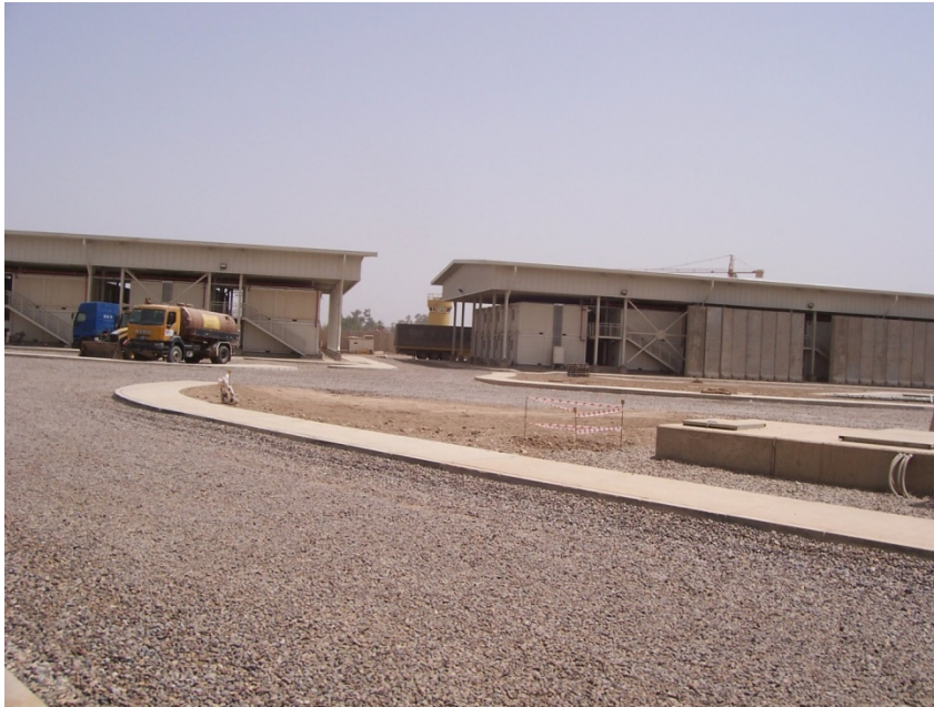
Figure 2—BPAX Containerized Housing Units

INL newly constructed compound to house the police advisors at Baghdad Police College Annex