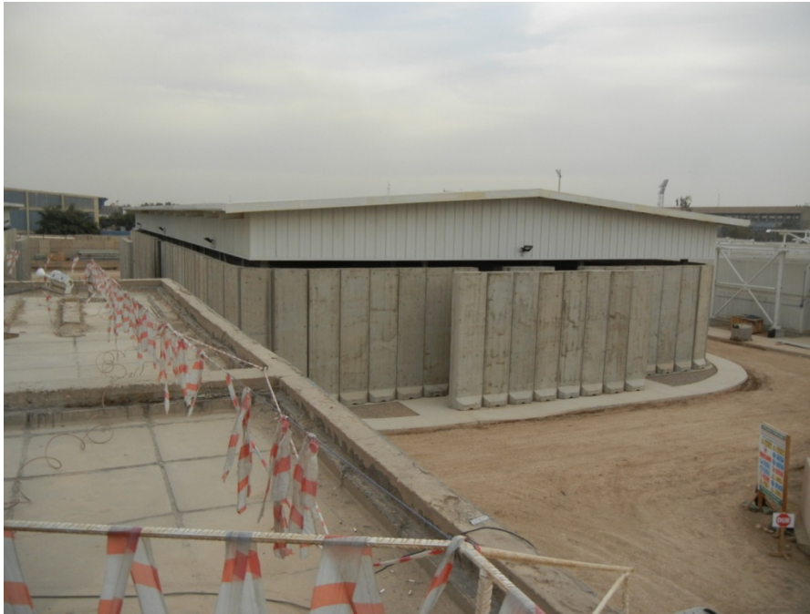
Newly constructed dining facility at Baghdad Police College Annex