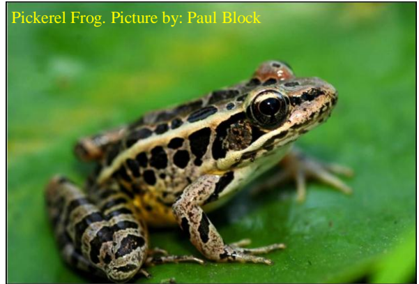
Pickerel Frog.