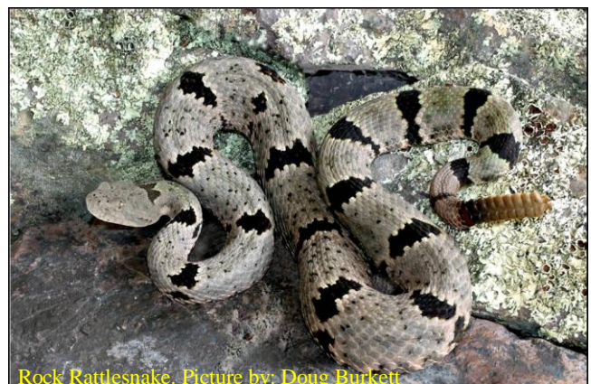
Rock Rattlesnake.