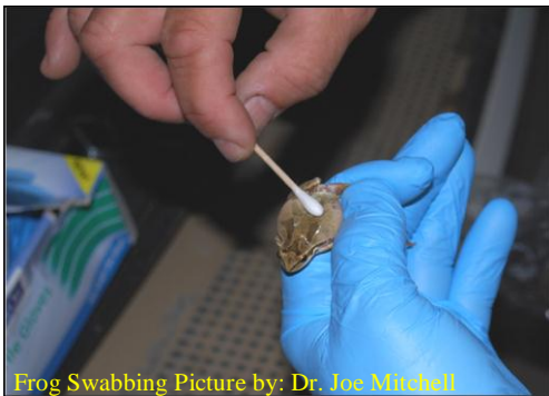
Frog Swabbing

http://www.denix.osd.mil/nr/upload/Final_Route_66_Bd_Report-with-appendix.pdf