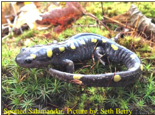
Spotted Salamander.

In support of military readiness, DoD PARC strives to sustain amphibian and reptile populations and their habitats through proactive management, conservation, stewardship, outreach, and partnerships.