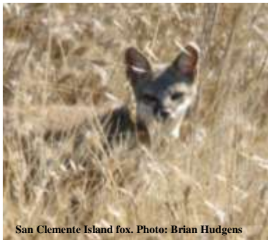
San Clemente Island fox.

Four of the six island fox subspecies have been listed for protection under the Endangered Species Act (ESA) due to rapid population declines caused by invasion of a novel predator or disease. The Department of Defense considers all six subspecies species at risk. The threat of an epidemic of a virulent disease, such as rabies or canine distemper virus (CDV) remains a concern for unlisted fox populations managed by the U.S. Navy on San Clemente and San Nicolas Islands, and mitigating that threat is a likely prerequisite for delisting populations on other islands. Predicting the course of a potential epidemic will facilitate a rapid and effective response and reduce the need for intensive captive-rearing programs or for further protection under the ESA.