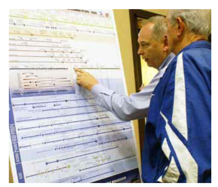
Second WTP Open House Held