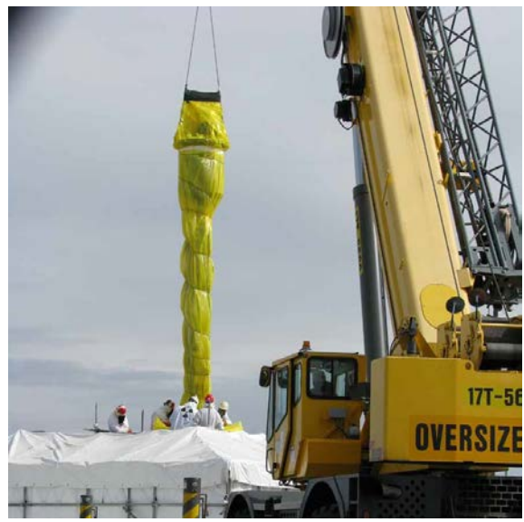
AN-106 Pump Successfully Removed in March - Retrieval activities in C-107 continue