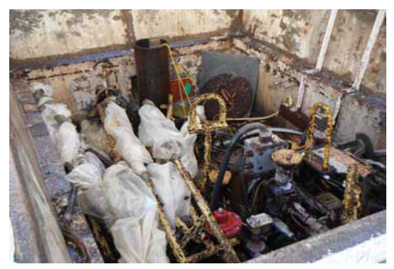
Before and after photos of C-102 B pit Cleaned in March