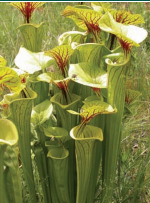
Opposite: Longleaf pine habitat, Fort Stewart, Georgia, (Photo courtesy of U.S. Army). Opposite inset: Yellow-throated warbler, NAS Patuxent River, Maryland, (© Arlene Ripley). Top: Orchid, Warren Grove Air National Guard Range, New Jersey, (© Douglas Ripley). Above left: Carnivorous pitcher plants, Fort Bragg, North Carolina, (Photo courtesy of Fort Bragg).

Helps build good relations with citizens beyond the fence line. U.S. citizens expect that federal land managers demonstrate responsible stewardship of public lands. The practice of biodiversity conservation fosters good will within communities surrounding military installations, which in turn engenders public support for the military mission.