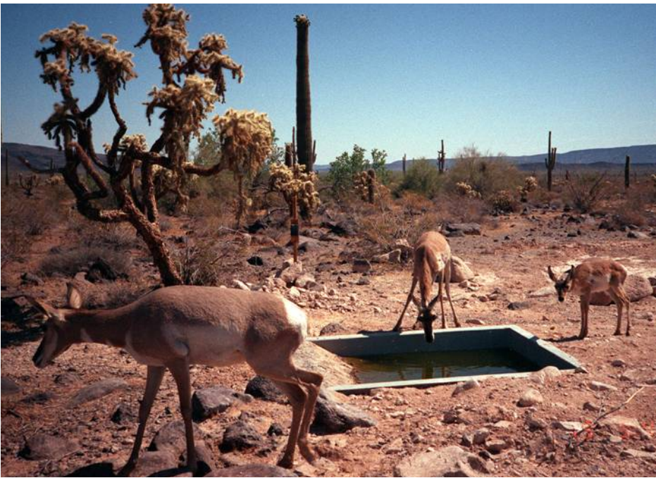
Sonoran pronghorn drink straight from constructed wells.

Previous research indicated that Sonoran pronghorn obtained their water solely from vegetation. The recovery team decided to test this theory by hauling water directly to the animals. AGFD, FWS, and Marine Corps staff carried water to a remote site three miles from the nearest road. Surprisingly, the pronghorn drank straight from the coolers. This significant finding led to the decision to construct water wells and forage enhancement plots. Water wells not only provide a direct source of water for the pronghorn, but also distribute water above ground to establish and maintain edible vegetation in the harsh desert conditions.