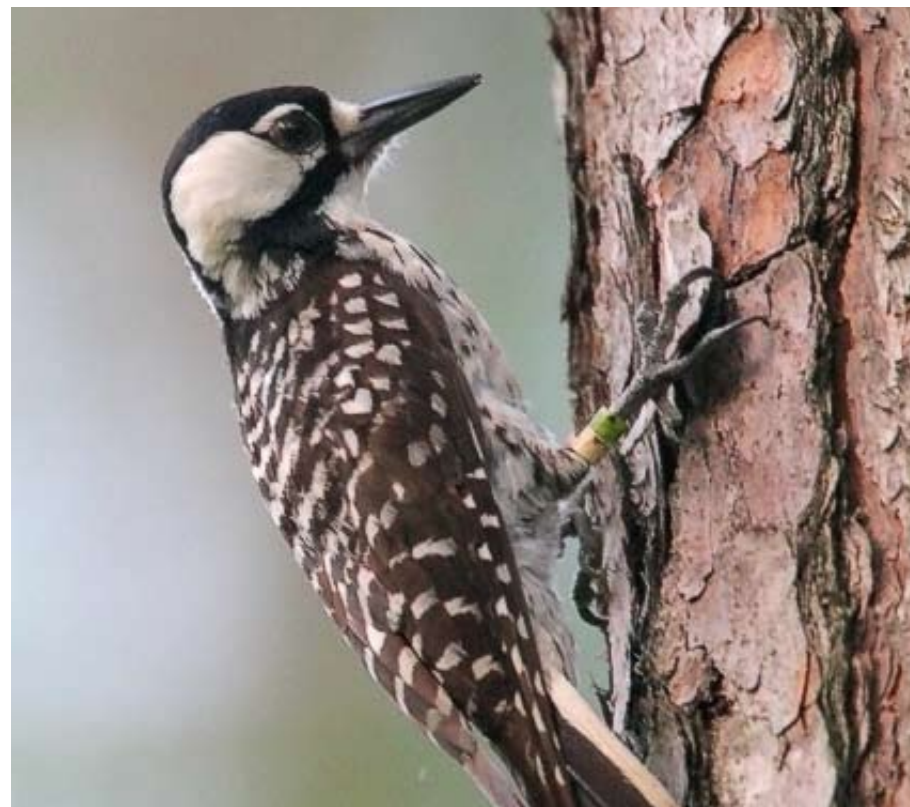
RED-COCKADED WOODPECKER BY GREG LAVATY

Army bases and Eglin Air Force Base (Florida) contributed most of the population increases in the 1990s. Fort Bragg (North Carolina) was the first public land unit to reach the population recovery goal of 350 nesting clusters, a 50% increase to its 1973 population. The North Carolina Sandhills Conservation Partnership and the Private Lands Initiative are models of public-private collaboration that have benefited Fort Bragg and this endangered species.