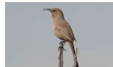
TOP TO BOTTOM: BROWN-HEADED NUTHATCH BY GREG LAVATY, BUFF-BREASTED FLYCATCHER BY CHRIS WOOD, HENSLOW'S SPARROW BY GREG LAVATY, LE CONTE'S THRASHER BY BRIAN SULLIVAN