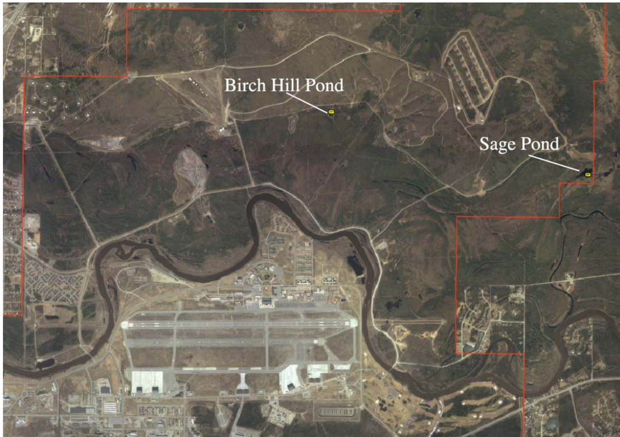
Figure 2. The western portion of the expanded study area showing locations off military lands where nests were monitored in 2010. (The city of Fairbanks is located in the lower right quadrant.)