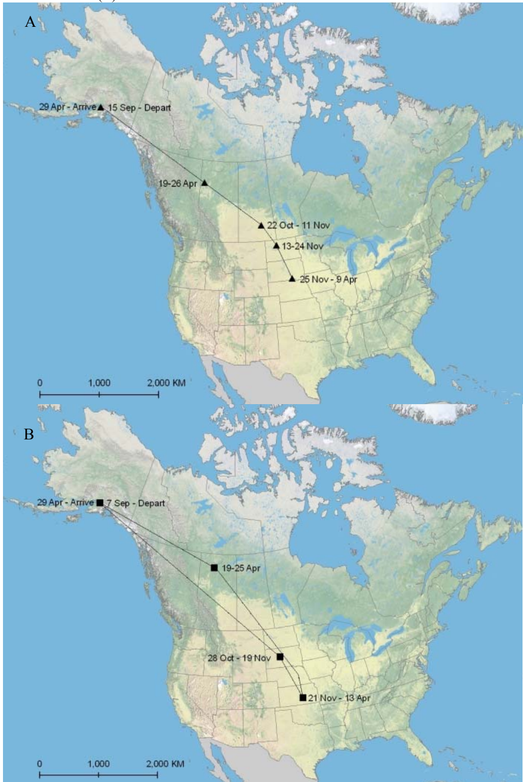
Figure 1. Annual movements with estimated arrival and departure dates for two female (A, B) and one male (C) Rusty Blackbirds captured in Anchorage, Alaska, 2009. Lines indicate approximate migration routes; single lines indicate no apparent differences in autumn and spring migration routes. We also include the information combined for all three birds (D).