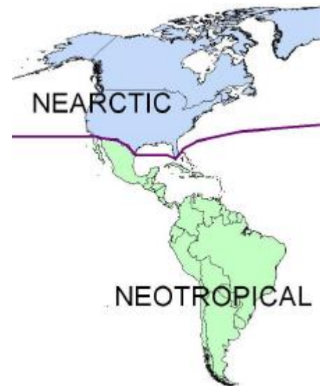
The U.S.-Mexico border is the approximate boundary between the nearctic and neotropical ecological regions.

Habitat destruction and disturbance are the primary threats to West Indian birds. Over the past several centuries, approximately 9 out of 10 avian extinctions have been of endemic island species. Many neotropical migrants share these same habitats and are also adversely affected by their