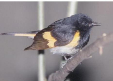
The American Redstart, featured on the Partners in Flight logo, breeds on DoD lands in the U.S. and winters on current and former DoD lands in Puerto Rico and Cuba.

The former Navy range on Vieques Island hosts excellent scrub (thick thorn, forest, and evergreen) and mangrove forest (white, red, black, and button) communities. The avian diversity includes eight endemics among the 40 resident species, as well as a dozen wintering neotropical migrants. This former range is being incorporated into the USFWS National Wildlife Refuge system.