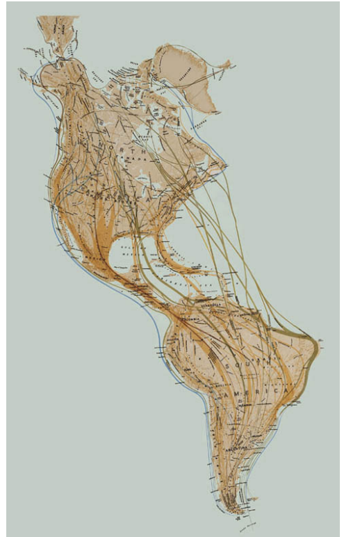
Migrations routes of neotropical migrants. Map: National Geographic Society

Cuba's exceptional biological value can be measured by its high number of endemic plants and animals. The creation of Naval Station Guantanamo Bay in 1903 resulted in the preservation of exceptional habitat for many of these species, some of which are endemic to either Guantanamo or Cuba and are declining elsewhere. A rapid ecological assessment conducted by The Nature Conservancy found eight Cuban endemic bird species were abundant on the base, and significant stopover and wintering use by migrants. A follow-up multi-year, year-round study by The Institute for Bird Populations produced models for apparent survival for seven neotropical migrants and six endemics. Nearly 170 bird species have now been recorded on the base, including nine Cuban endemics.