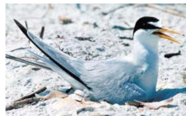
Least Turn ( Sterna Antillarum )

The Legacy Program is a source of conservation and preservation management funds for projects that directly relate to the DoD mission. The Legacy Program is NOT a grants program. Program funding requires the recipient(s) to enter into a bi-lateral agreement with DoD (or designee). When approved, Legacy Program funding is conditional on the agreed-upon project completion dates, periods of performance and delivery of expected products that must be satisfactorily met. Expected final products vary and may include (but are not limited to) items such as management plans, fact sheets, hardcopy or electronic reports, GIS data, and audio or visual representation of the completed project.