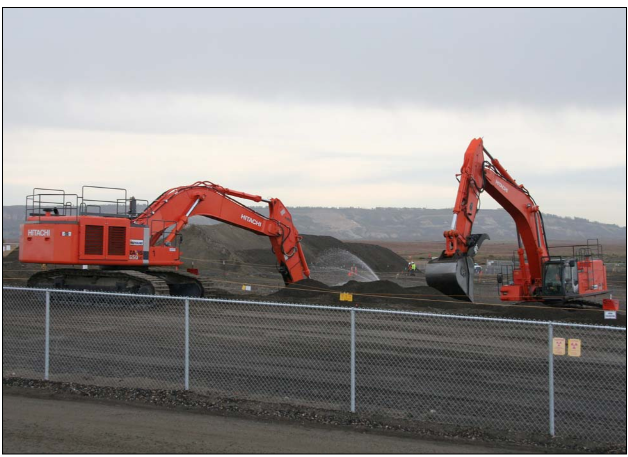
Washington Closure Hanford continues trench excavation on the north side of the burial ground. (Photo 6)

The project team set the final water storage tank and connected it to the piping system. A second drum penetration facility also was delivered to the site. The drum penetration facility will be set up next week.