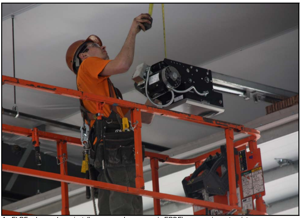
An ELRFowler employee installs a garage door opener in ERDF's new equipment maintenance facility/operations center. (Photo 4)

WCH began installing the Global Positioning System and wireless equipment for ERDF's new waste container tracking system. The system, designed by Pacific Northwest National Laboratory, will provide status reports at waste generation sites, which will assist management in making daily assignments. Testing is scheduled for later this month.