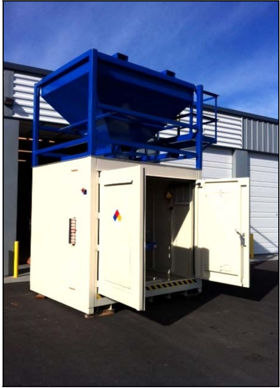
Washington Closure received a second drum penetration facility at the 618-10 Burial Ground. (Photo 7)

The 618-10 Burial Ground operated from 1954 to 1963, receiving low- and high-level radioactive waste from 300 Area laboratories and fuel development facilities. Low-activity wastes were primarily disposed in 12 trenches, while the moderate- and high-activity wastes were disposed