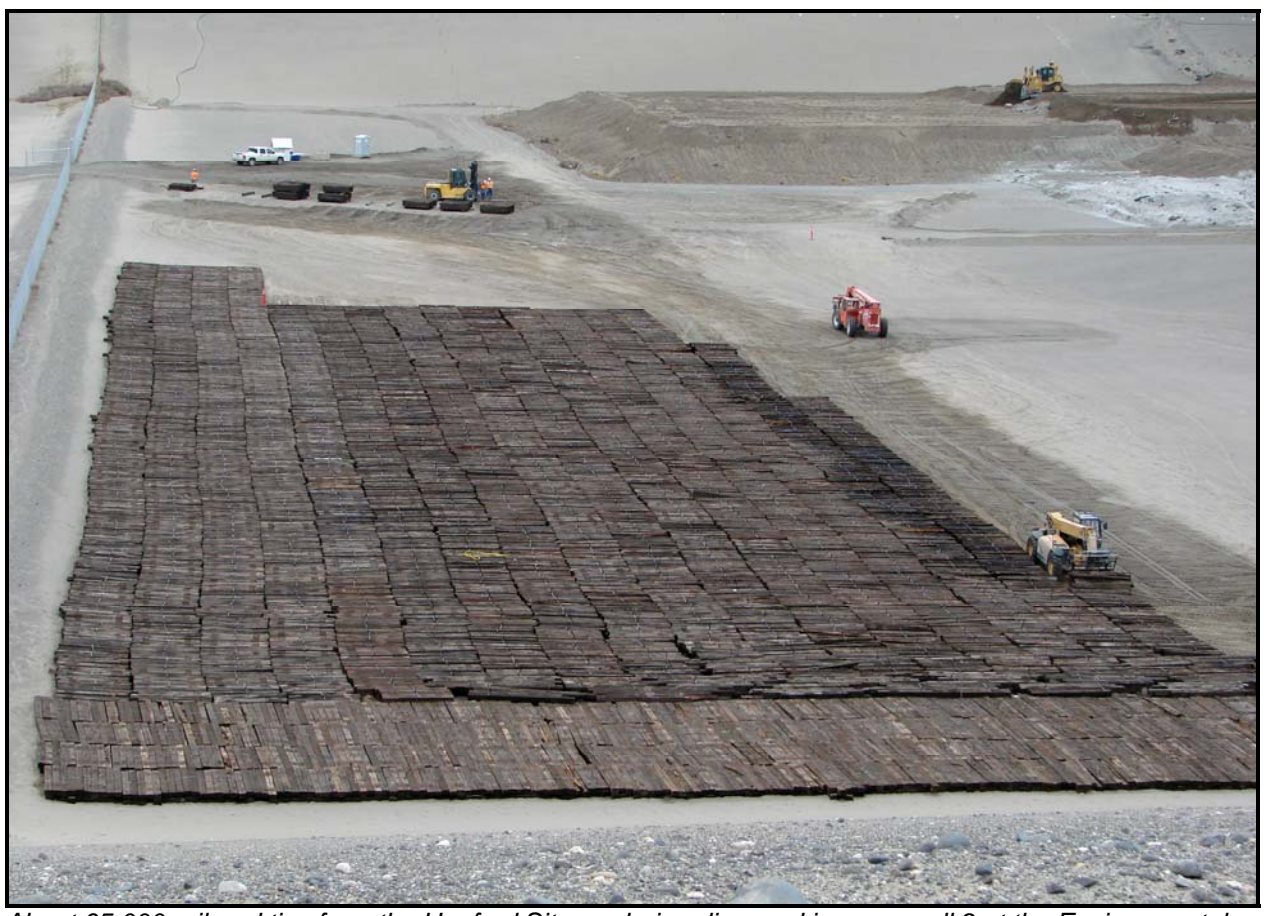
About 65,000 railroad ties from the Hanford Site are being disposed in super cell 9 at the Environmental Restoration Disposal Facility. (Photo 1)

Super cell 9 was placed into service in mid-February. WCH and subcontractors TradeWind Services and DelHur Industries completed construction of both super cells with no recordable injuries, months ahead of schedule, and more than $16 million under budget.