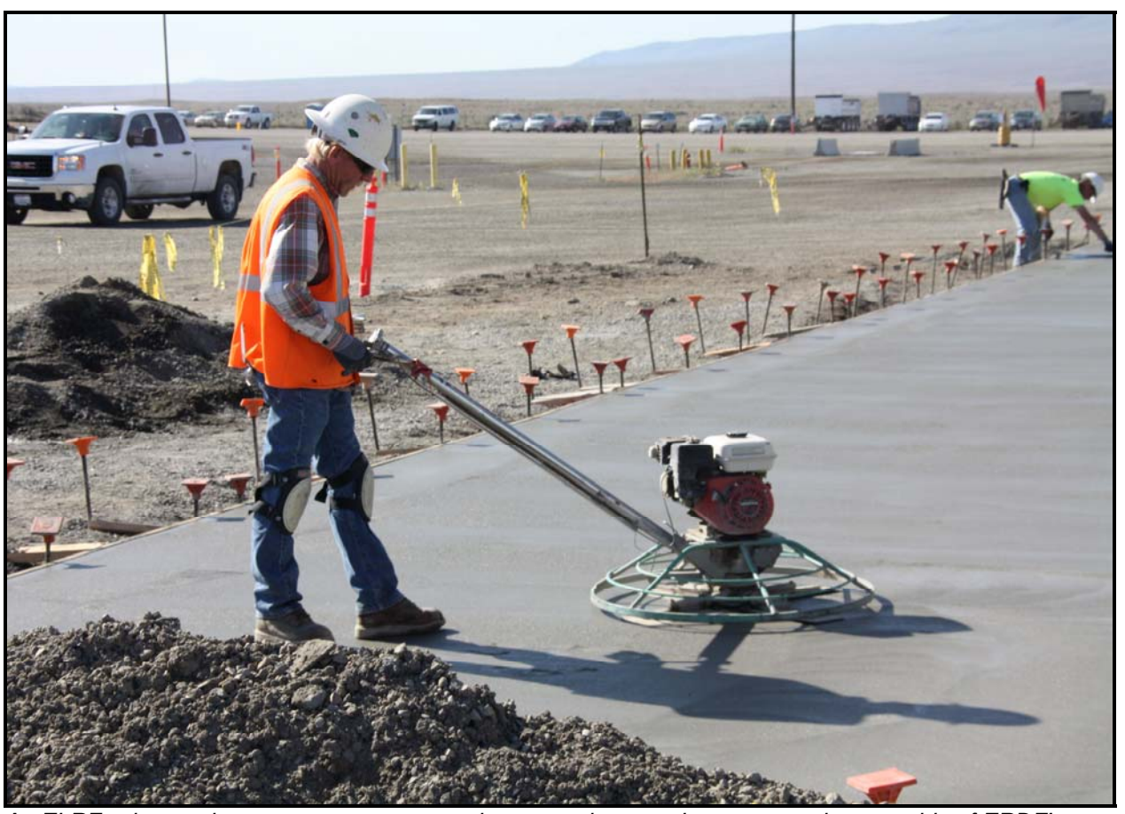
An ELRFowler employee uses a power trowel on recently poured concrete at the east side of ERDF's transportation maintenance facility. (Photo 2)

The expanded transportation maintenance facility will include two additional truck bays, a large concrete pad, an exterior awning that will cover two smaller concrete pads, and a conference room. The project began pouring the concrete footers on the east side of the building.