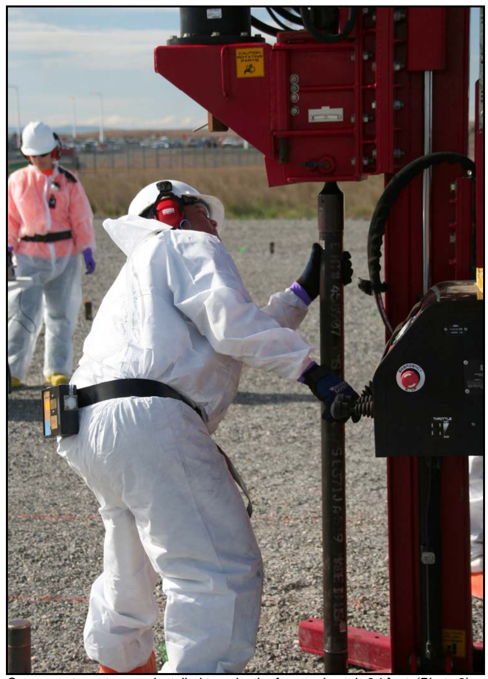
Cone penetrometers are installed to a depth of approximately 24 feet. (Photo 9)