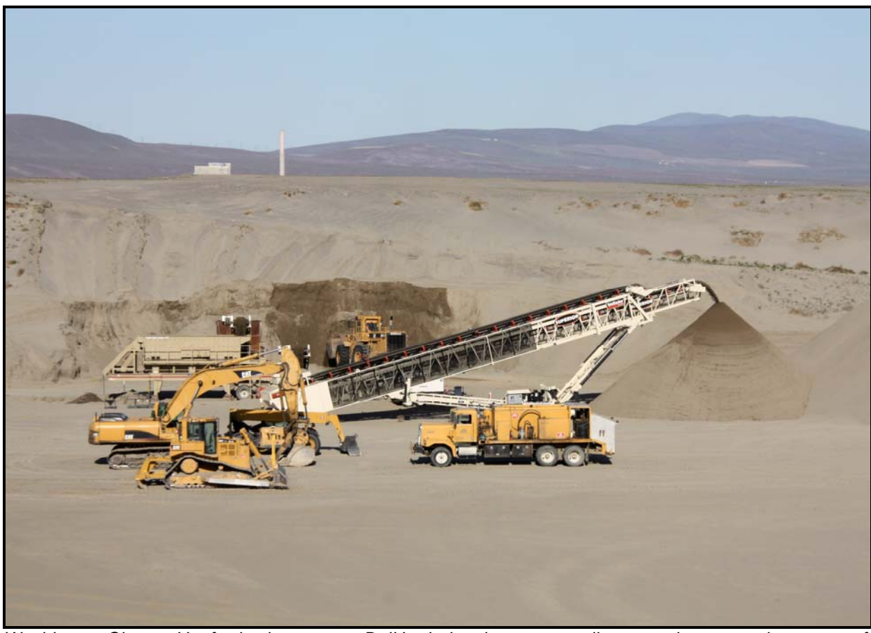
Washington Closure Hanford subcontractor DelHur Industries tests a soil screen plant set up in support of ERDF's new batch plant. (Photo 5)

The final report for ERDF's new septic system has been submitted to the Washington State Department of Health. The septic system was designed by Columbia Engineers and Constructors, a small business based in Richland, Washington.