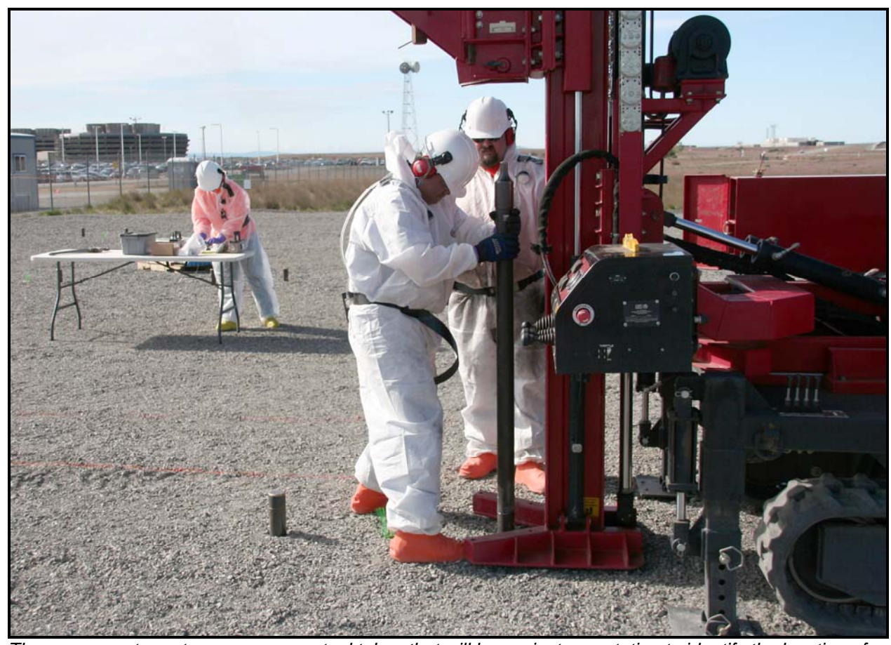
The cone penetrometers are narrow steel tubes that will house instrumentation to identify the location of radioactive materials within the vertical pipe units at the 618-11 Burial Ground. (Photo 10)

Before beginning installation of the cone penetrometers, WCH conducted geophysical delineation to help locate each of the burial ground's VPUs and caissons. The delineation was determined using reconnaissance-level magnetic field survey, detailed-level magnetic and time-domain electromagnetic induction (TDEMI) survey, and ground-penetrating radar (GPR) survey.