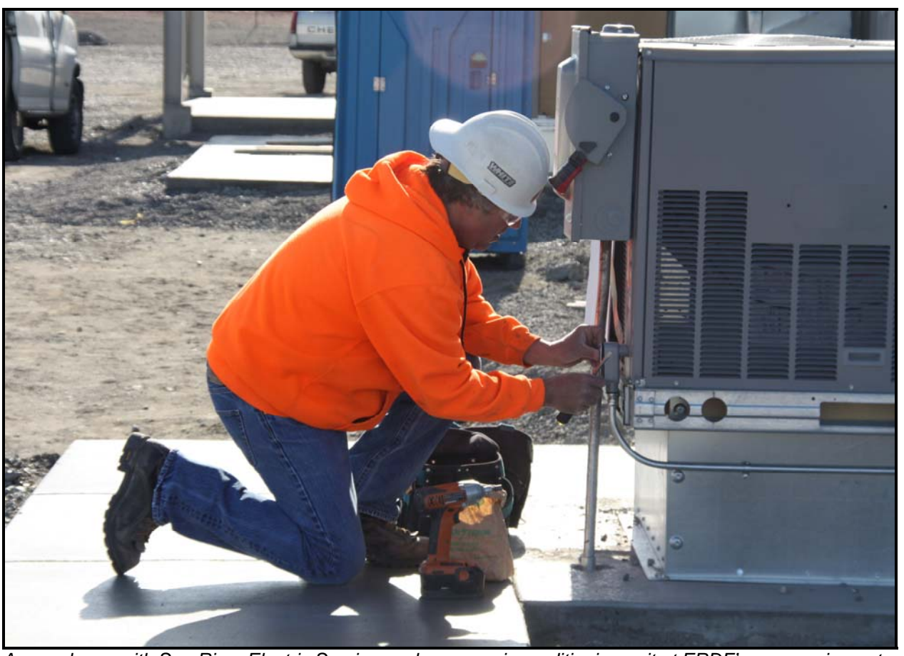
An employee with Sun River Electric Service works on an air conditioning unit at ERDF's new equipment maintenance facility/operations center. (Photo 3)