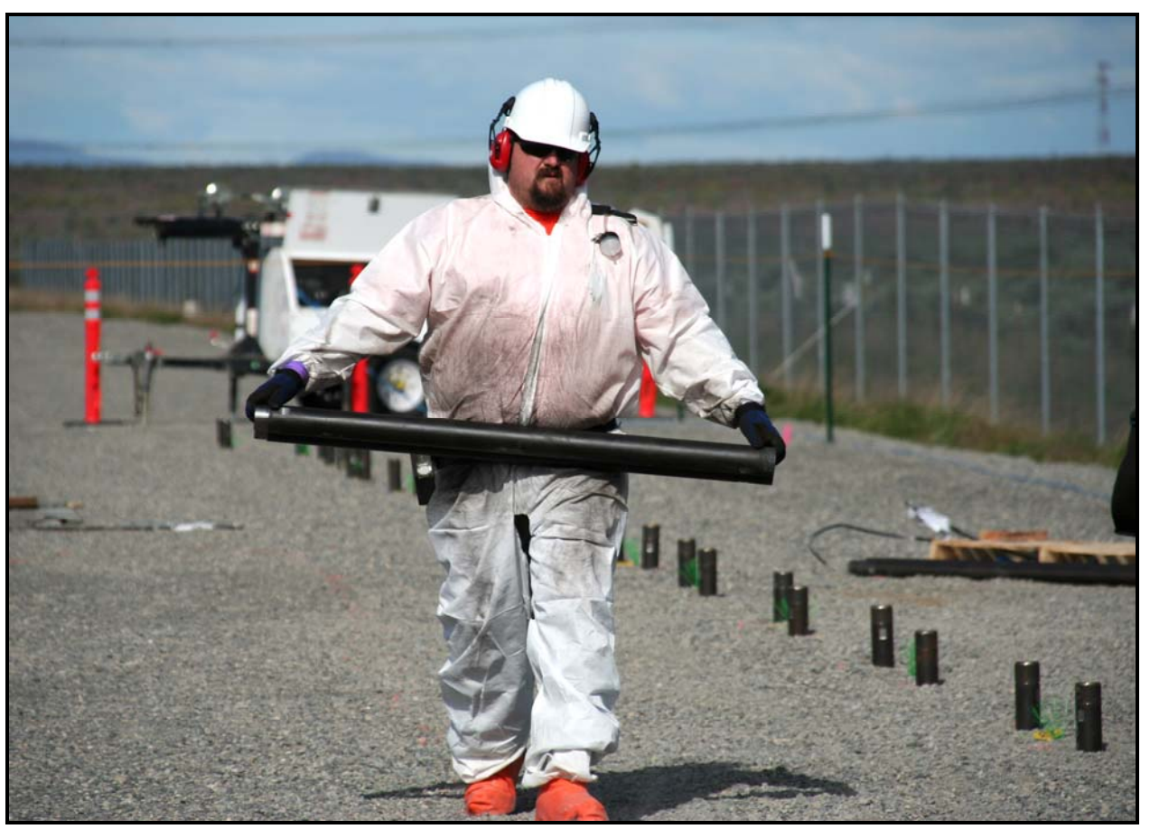
Washington Closure Hanford subcontractor North Wind installing cone penetrometers at the 618-11 Burial Ground. (Photo 8)

North Wind installed two cone penetrometers (narrow steel tubes) about 6 to 8 inches from the exterior of each VPU and to an approximate depth of 6 feet below the VPU. A gamma-logging probe will now be inserted into the cone penetrometers to identify the location of radioactive materials within the VPUs.