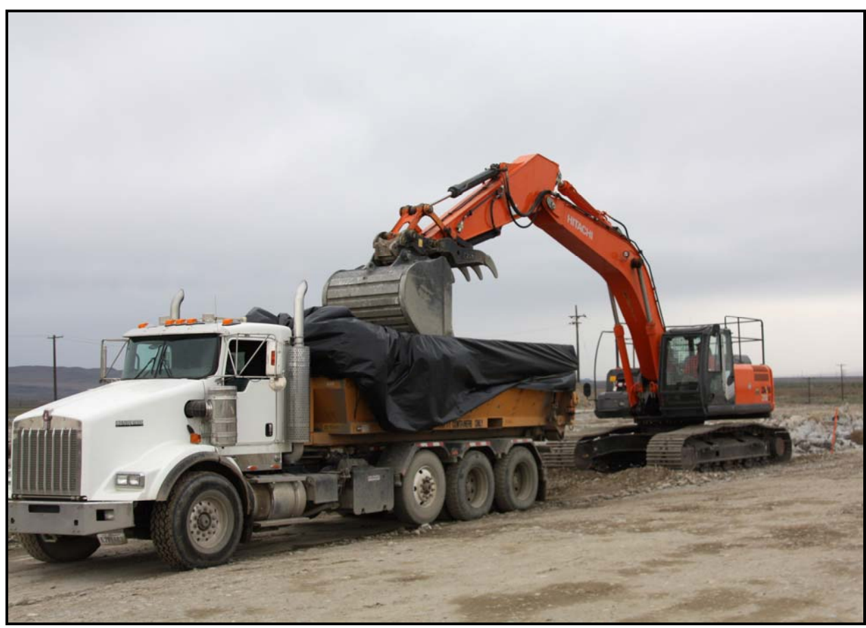
Washington Closure Hanford subcontractor Ojeda Business Ventures loads out rubble from 100-F-57. (Photo 11)

WCH and subcontractor Ojeda Business Ventures continued with the remediation of 19 waste sites at 100-F Area. The project team is demolishing concrete at 100-F-57 and loading out concrete and underlying soil. The site consists of stained concrete and soil containing hexavalent chromium. Closeout samples also were collected from 100-F-44:9 (steel pipeline).