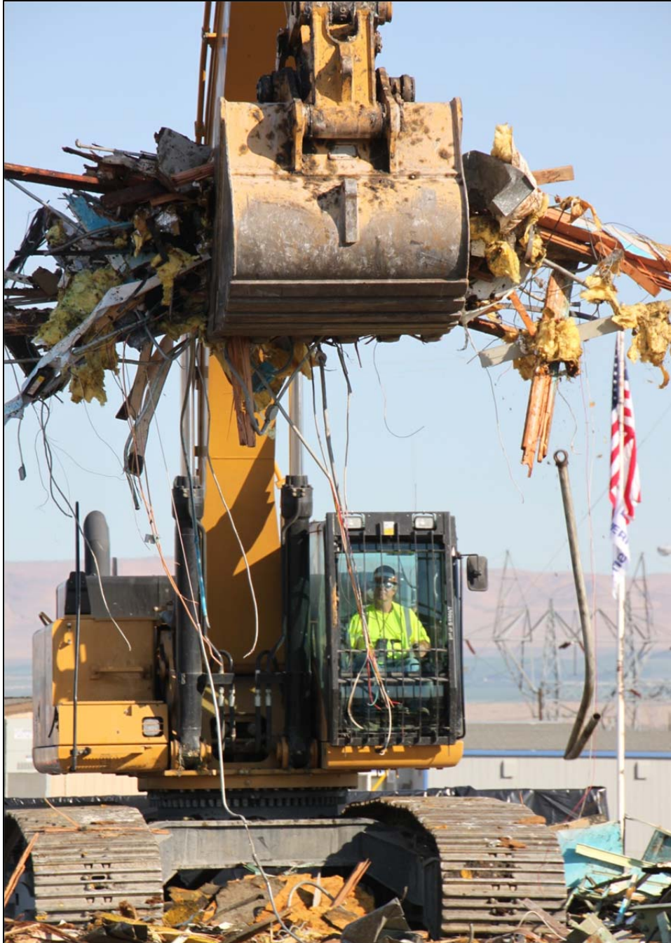
An operator lifts debris from the demolition of the 1720-K Main Administrative Office Building at the entrance to the 100K Area.