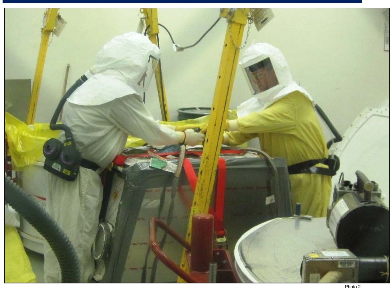
One of five sections of a 70-foot-long conveyor glovebox is prepared to be loaded into a standard waste box for shipment and offsite disposal as transuranic waste.