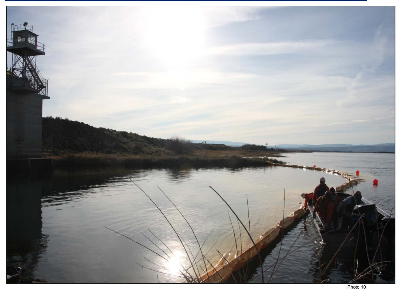
A silt barrier is constructed surrounding the site of the 181-KE River Pump House. The barrier will help control and minimize potential impacts to the river during demolition activities.