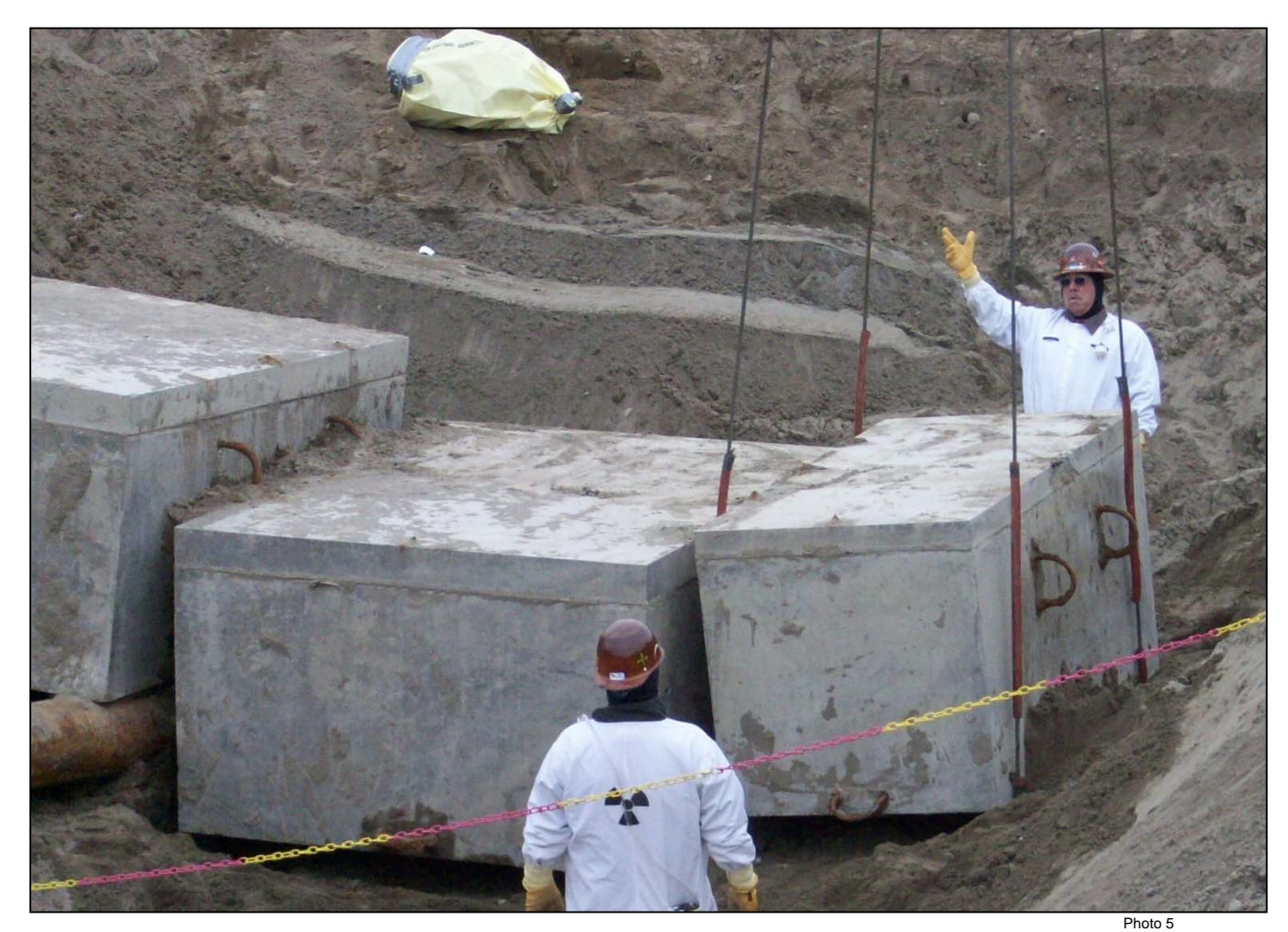
Hoist and rigging personnel direct a crane lifting a concrete waste box from Trench 11 in the 4B burial ground. The box is one of three that CHPRC removed from the trench last week with support from Recovery Act funding.

At the 12B burial ground, crews prepared to set up a contamination area and overhead misters in preparation for drum removal at Trench 17. A propane storage area was also set up. The propane will fuel forklifts used to transport drums on pallets. Installation of the conveyor system drum guard for the Gamma Assay System is complete. The conveyors move the drums in/out of the Gamma Assay System.