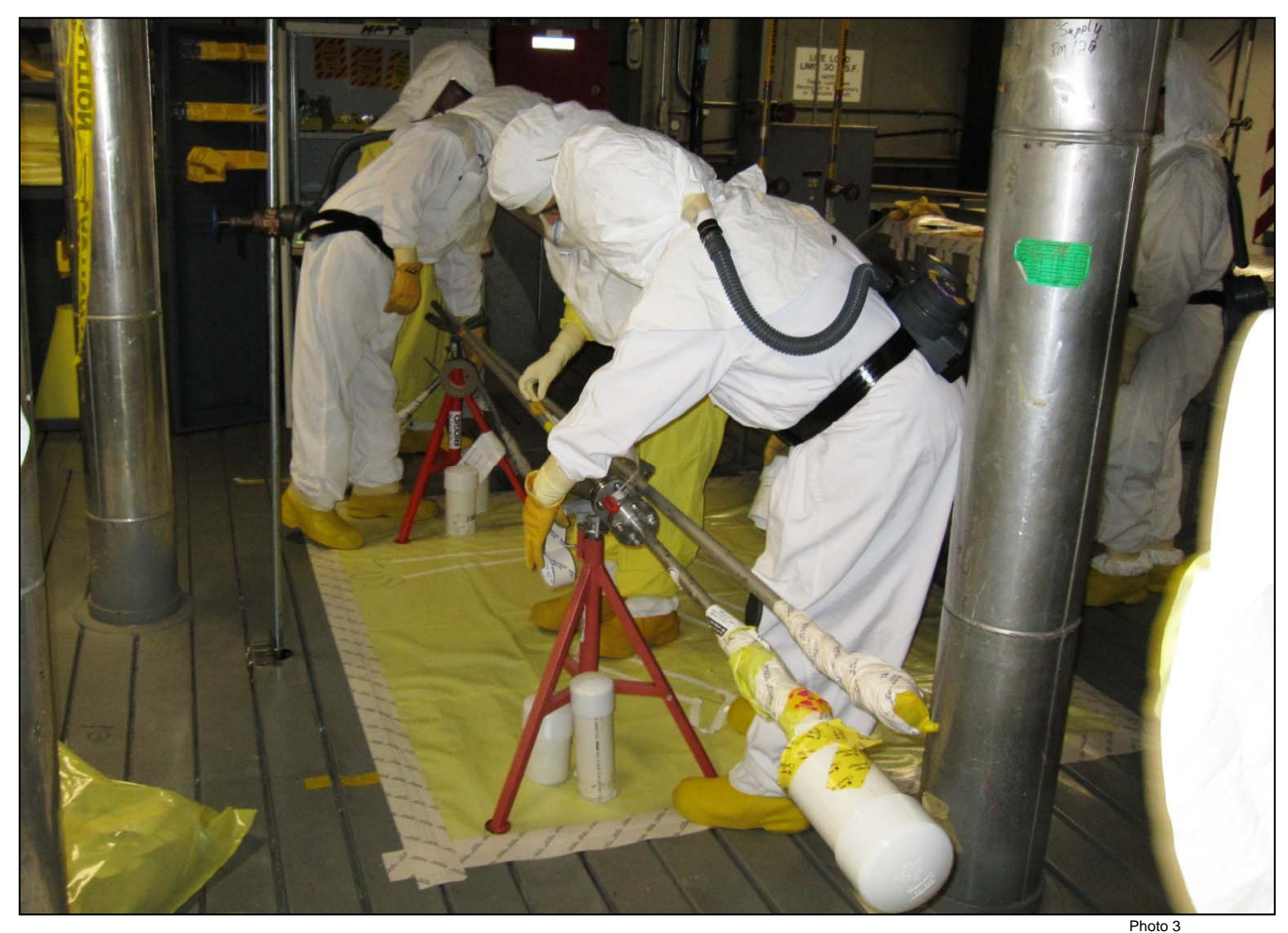
Workers size reduce process piping removed from the Plutonium Finishing Plant. The piping is size reduced, or cut into pieces, to be loaded into a standard waste box for shipment to Hanford's Waste Receiving and Packaging facility for future disposal at the Waste Isolation Pilot Plant in New Mexico.

the next shipment to PFNW. While removal of process vacuum system piping continued – with 87 feet removed last week – the process transfer line removal crew initiated size reduction and packaging of their previously removed lines; removal of the piping will resume in the near future.