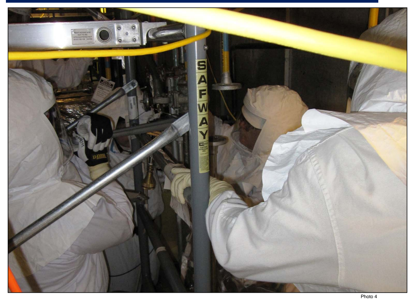
Removing process vacuum system piping often requires workers to operate on elevated scaffolding in tight quarters amongst a complex network of piping and ductwork running throughout the Plutonium Finishing Plant.