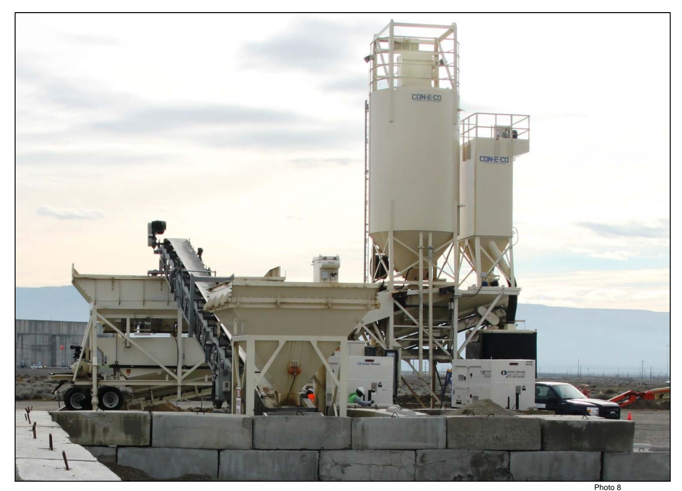
Construction of the grout batch plant for U Canyon continues.

Construction of the on-site batch plant continued. Interior core drilling operations began.