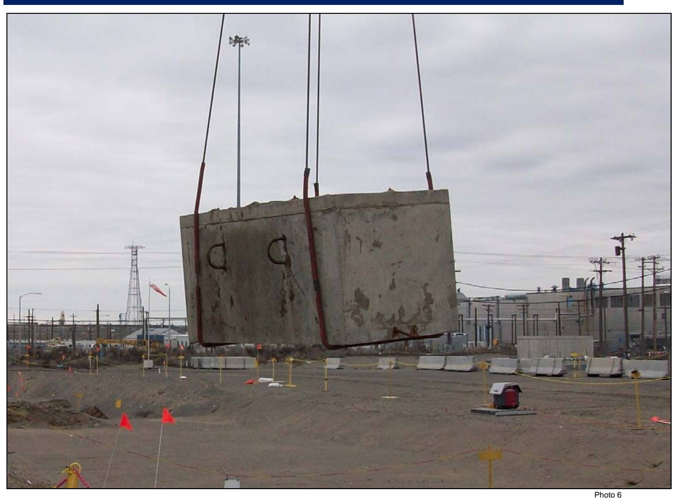
A concrete box of transuranic waste is lifted via crane from an underground storage trench. The box will be assayed and then shipped to the Central Waste Complex or to Perma-Fix Northwest.