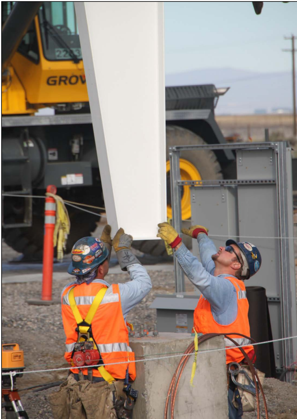
Workers position a piece of structural steel for the Radiological Facility that will be part of the 200 West Groundwater Treatment Facility.