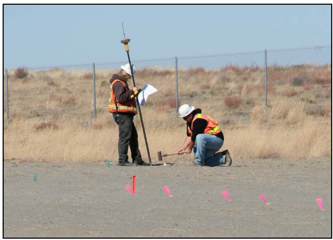
Last week, workers from Permit Surveying placed markers near trenches at the 618-10 Burial Ground in preparation for nonintrusive characterization, scheduled to begin in late October.

Civil surveys for the placement of the cone penetrometers at the 618-10 Burial Ground were completed this week. Stakes were placed to indentify insertion points for the cone penetrometers. The 100 cone penetrometers will be inserted in the 23 selected trenches. In addition, four penetrometers will be inserted around each of the 94 vertical pipe units.