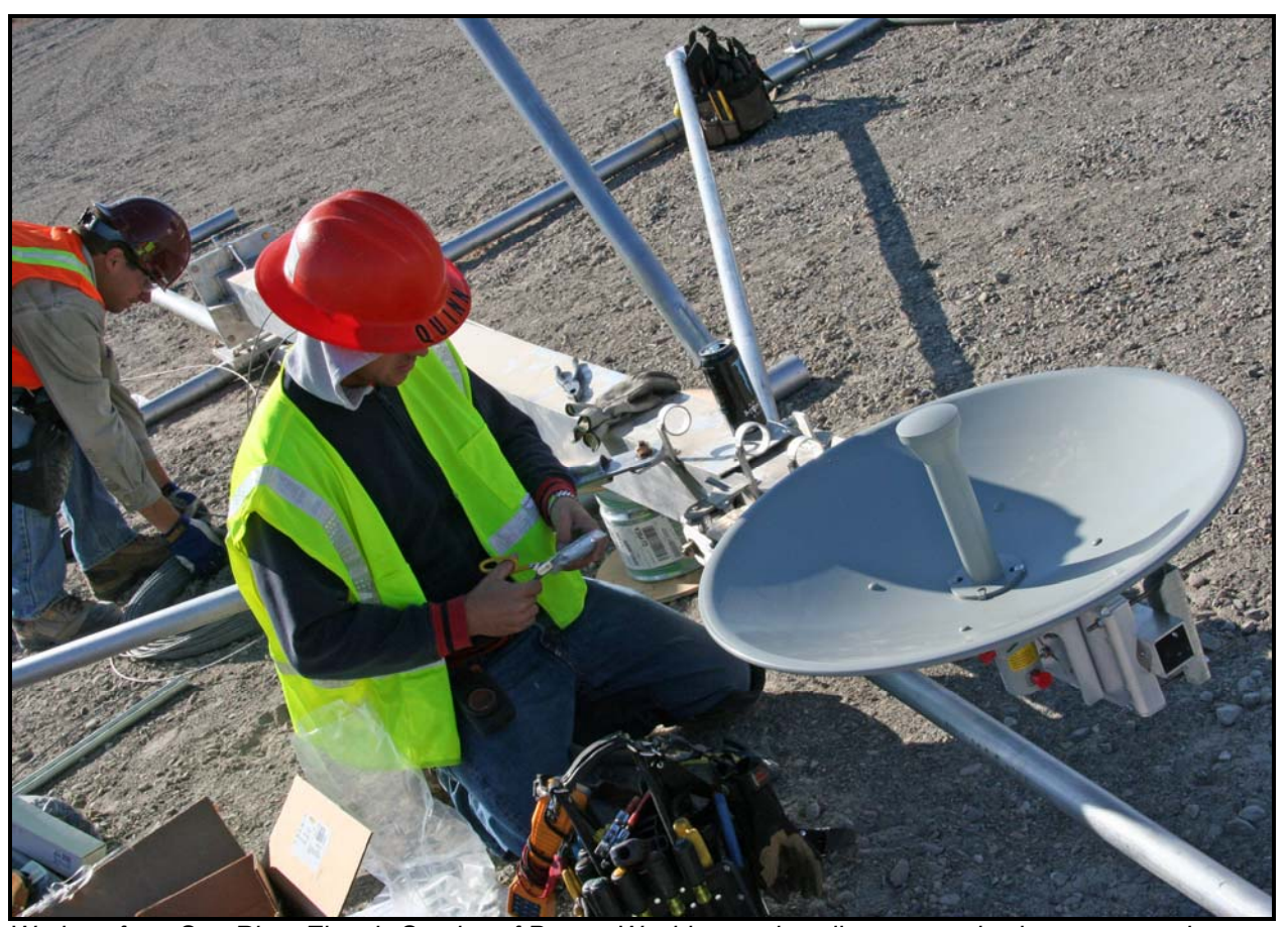
Workers from Sun River Electric Service of Pasco, Washington, install a communications tower at the 618-10 Burial Ground. The tower will provide Internet services at the remote location where clean-up activities at the high-risk site will begin later this year.

the site. Electricity is provided by generator and potable water is trucked in. Portable units serve as restroom facilities.