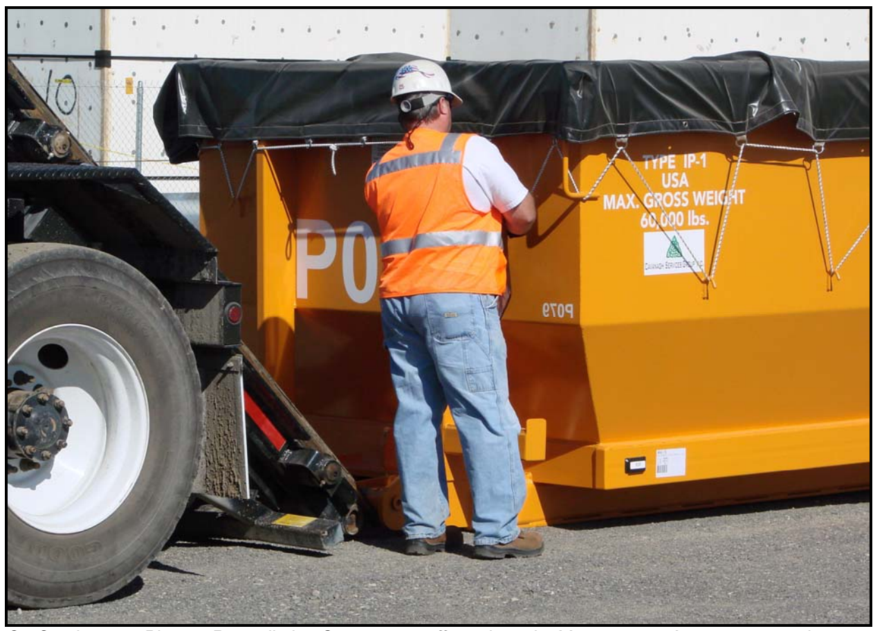
On October 7-8, Plateau Remediation Contractor staff conducted a Management Assessment on the use of their containers and trucks as part of the October 1 start-up of "ready to serve" operations at the Environmental Restoration Disposal Facility.

With PRC management reviews still underway on October 8, and a total of 15 waste shipments made via super dumps at the end of the week, WCH anticipates a slow ramp up of PRC waste disposal activities the week of October 12.