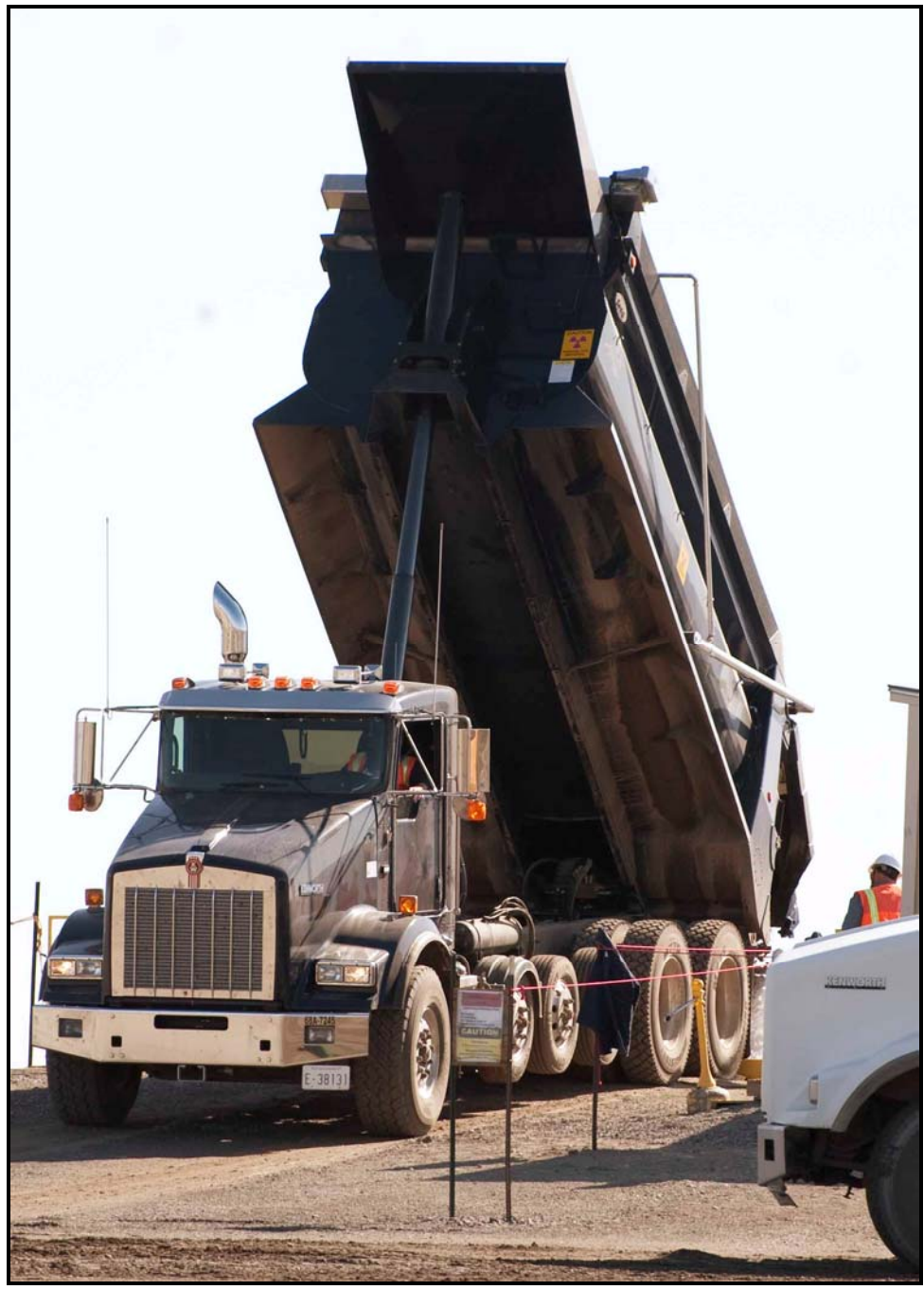
PRC's super dump truck start-up review was completed on October 6, and the ramp used for the first time on October 7 as part of the ERDF ready-to-serve concept for fiscal year 2010.

In other activities, the final of six waste transport trucks to be used to support waste disposal for other Hanford contractors arrived this week, as did two new bulldozers. The trucks were