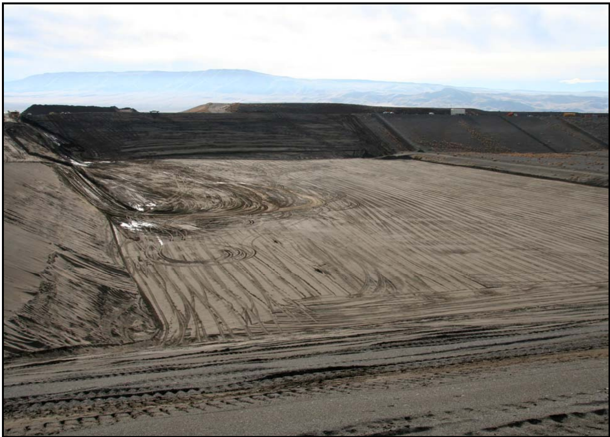
Washington Closure Hanford subcontractor DelHur Industries has excavated close to 1.8 million cubic yards of dirt from super cell 9 at the Environmental Restoration Disposal Facility.

WCH subcontractor DelHur Industries has reached the specified depth of super cell 9 and is now shaping the sidewalls of the super cell. To date, DelHur has excavated 1,789,637 cubic yards of material, including 263,913 cubic yards of stockpile removal.