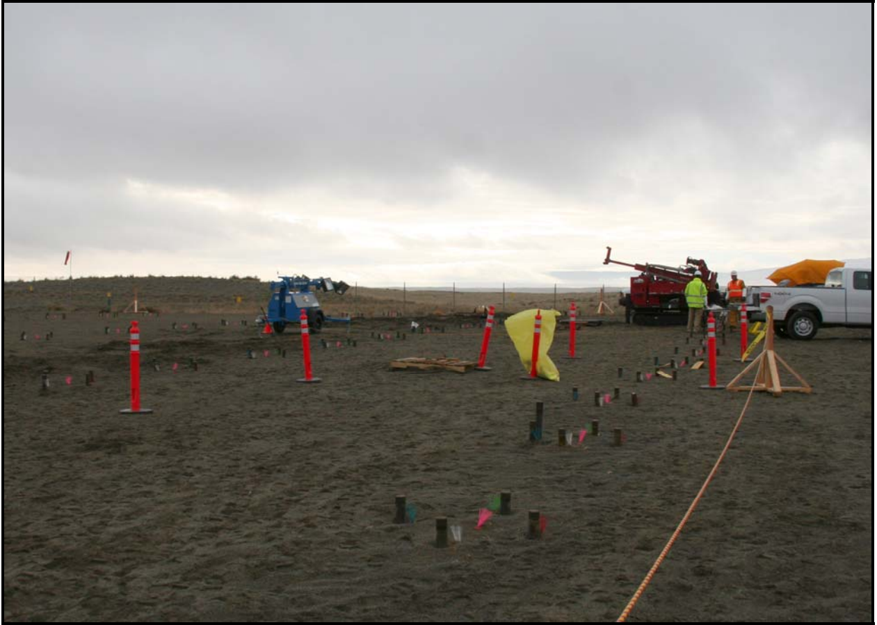
The 618-10 Burial Ground contains 94 vertical pipe units and 23 trenches.