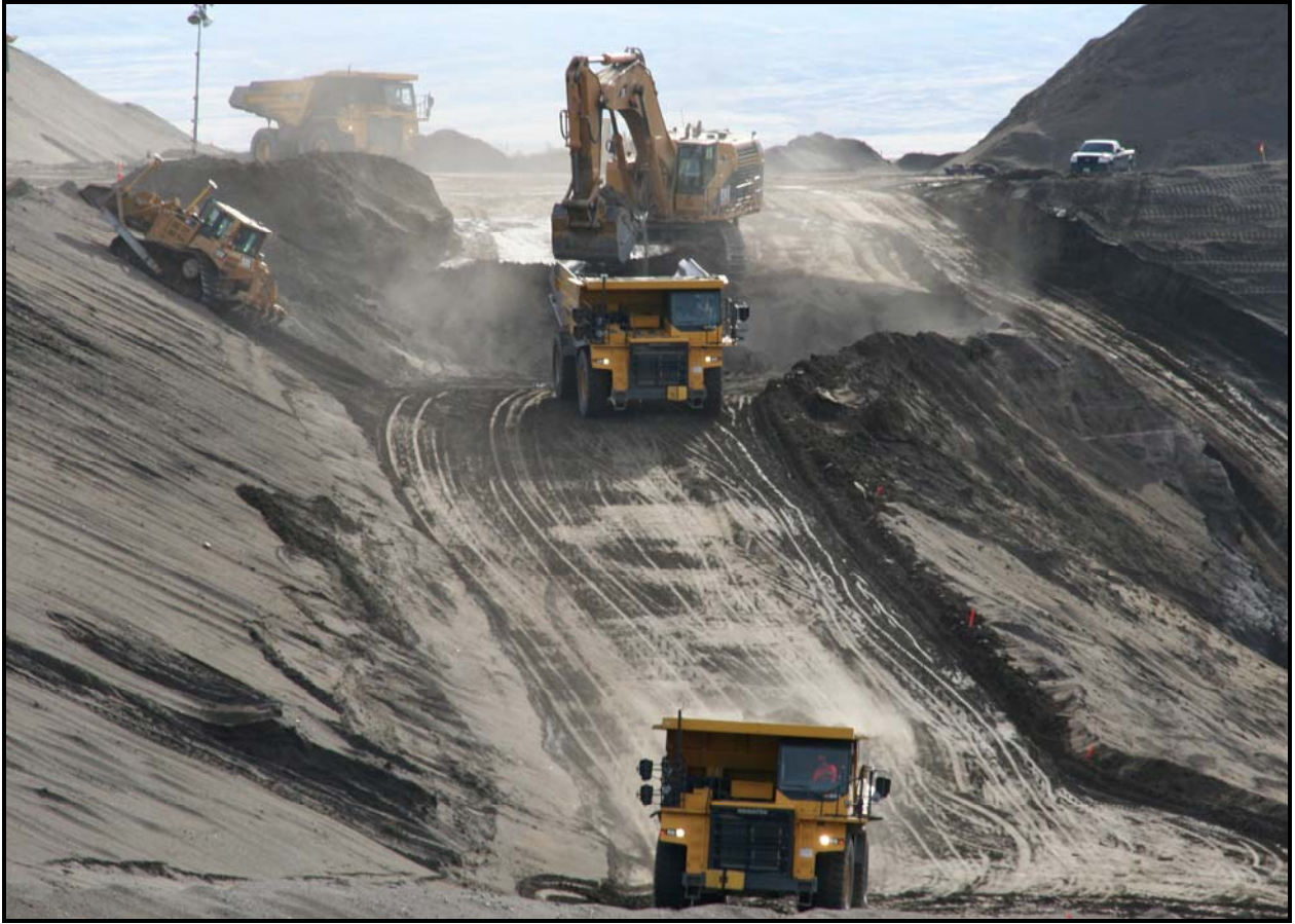
DelHur Industries personnel excavate the south ramp of super cell 9 at the Environmental Restoration Disposal Facility.