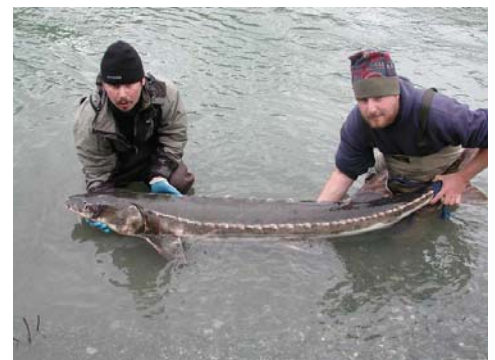
Green sturgeon, Acipenser medirostris.