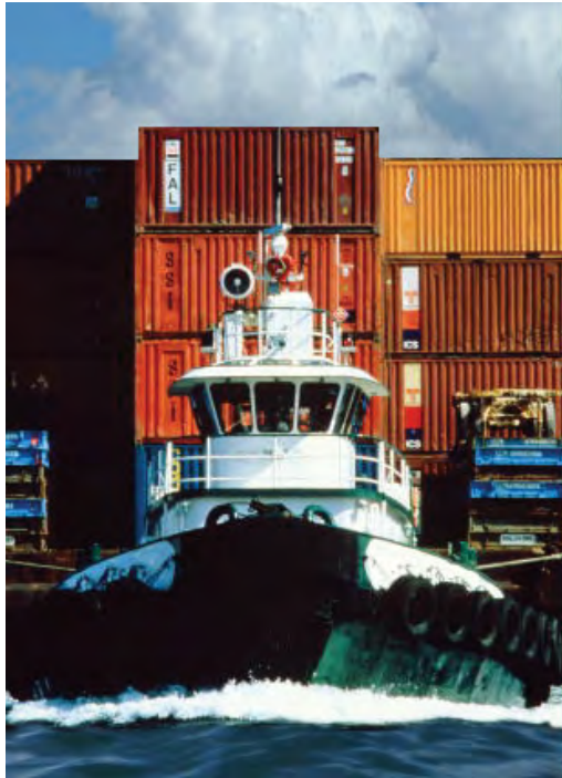
The Green Trade Corridor maritime highway will relieve congestion and reduce greenhouse gas emissions in Northern California