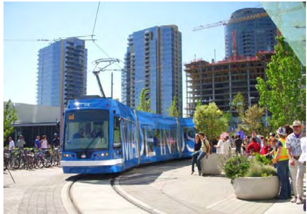
Tucson's Streetcar will connect distressed communities with employment opportunities and spur corridor development.

The TIGER program's broad, multi-modal scope enables DOT to fund projects that strengthen local and regional economies, support communities by expanding transportation choices and foster connections to places people work, play and live.