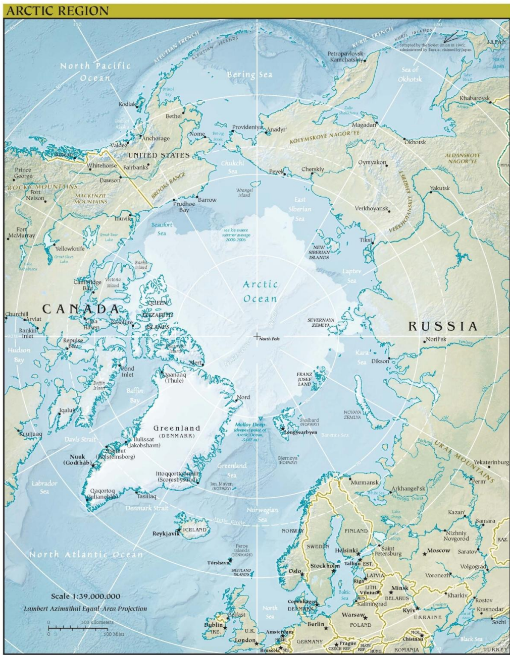
CIA World Factbook