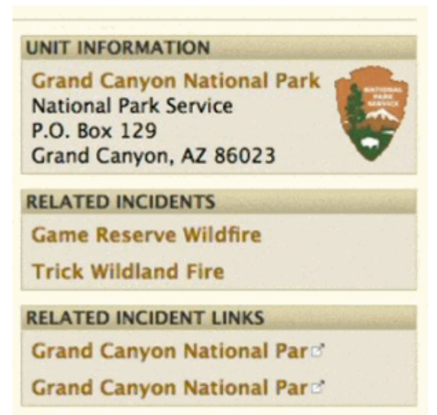
Figure 22. Example of how related links are displayed on the public site.

Use the following steps to add a link to your incident record.