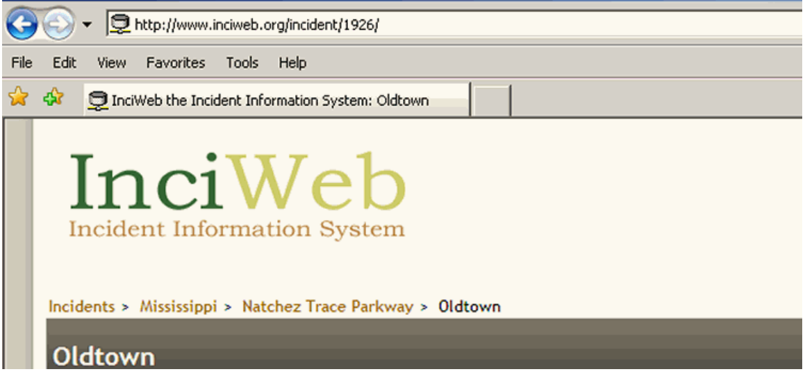
Figure 33. Example incident showing the URL to the specific record in the address field of the Web browser.

5. Select or copy the entire address from the Web browser and save it in a text document or email. Alternately, you can make a note of the address by hand or by another method. You can then send the address to interested organizations and individuals so that they can go directly to your incident record on InciWeb.