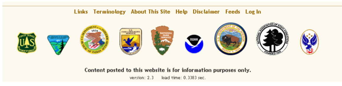
Figure 3. Example of the footer section of public InciWeb pages.

Below the footer links are logos for many of the incident response agencies that are approved to use the InciWeb system. Each of the logos is also a link to the agency's Fire and Aviation website. Moving your mouse cursor over an agency logo and clicking the mouse button will take you to the corresponding agency website (and away from InciWeb). You can use the back arrow button or command for your Web browser to return to InciWeb.