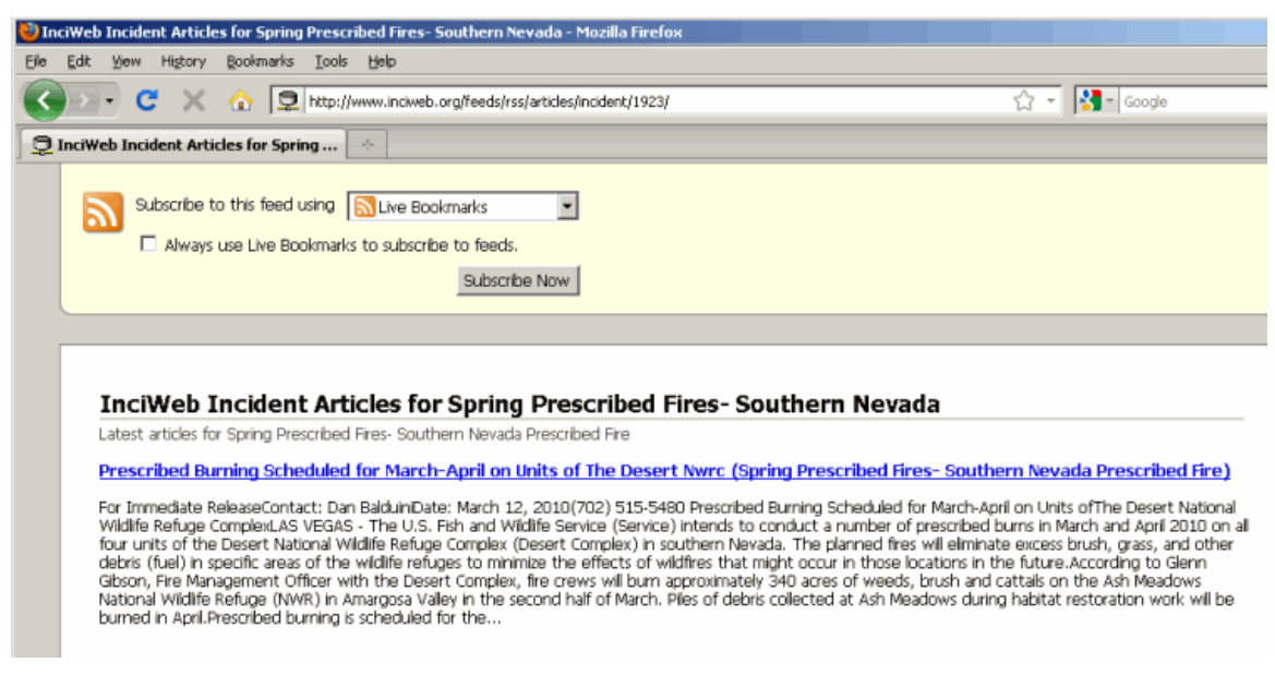
Figure 34. Example of an InciWeb RSS feed as viewed in the Firefox Web browser.

Figure 34 shows an example of the RSS Feed output for an incident displayed in the Mozilla FireFox Web browser (version 3.6).