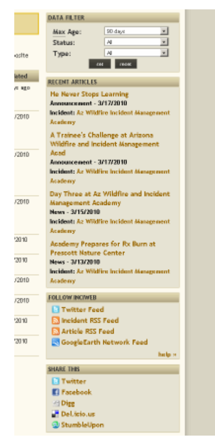
Figure 2. Example of the boxed sections in the right-hand column of InciWeb pages.

When you view an individual incident record, additional sections are added to the column on the right side to include a box identifying the unit or agency responsible for the incident record and a box with contact information. If you are the PIO or the designated public spokesperson for the unit, your name and contact information would be displayed in this section for all incidents being managed by your unit.