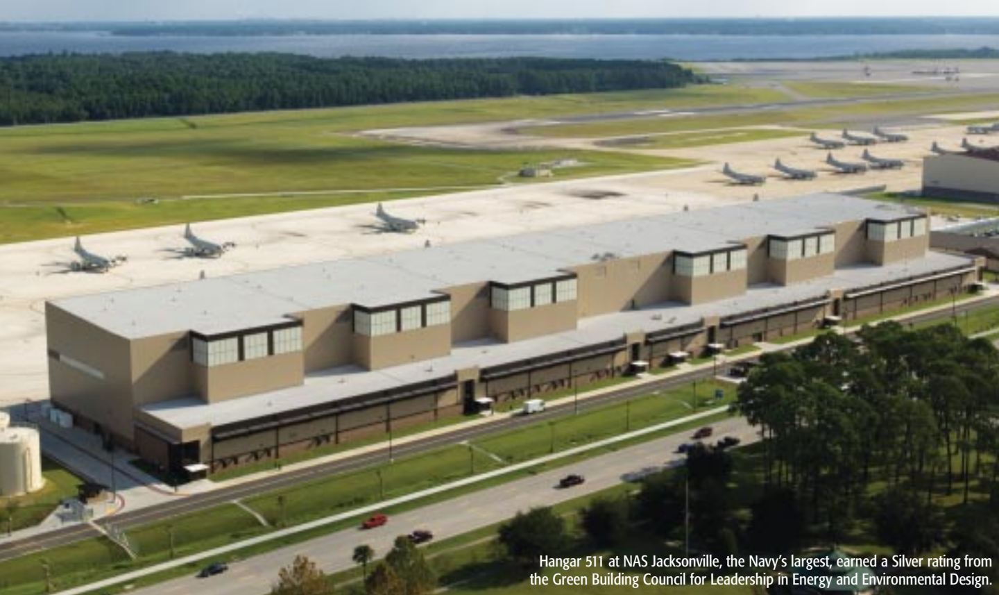
Hangar 511 at NAS Jacksonville, the Navy's largest, earned a Silver rating from the Green Building Council for Leadership in Energy and Environmental Design.