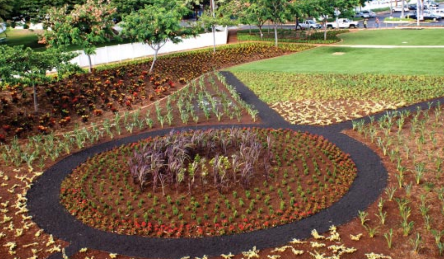
Xeriscape landscaping at the Navy Exchange Mall and Commissary in Pearl Harbor, where fresh water is scarce.