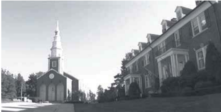
Coast Guard Memorial Chapel and Officers Row

To foster the welfare and success of Cadets, numerous services are provided by way of academic assistance, personal and professional counseling, religious activities, and administrative support.