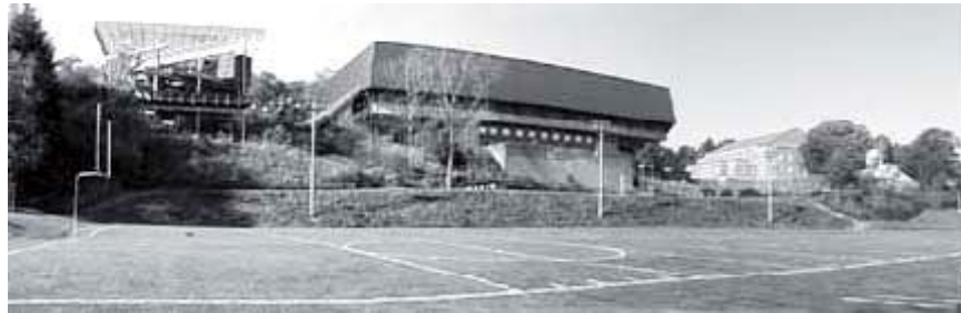
Visitor's Center, Roland Field House, Billard Gym

Many factors contribute to development of leaders of character. Not only does the Coast Guard Academy maintain responsibility for the intellectual and professional development of cadets, but it is also devoted to each cadet's physical development and wellness. This is accomplished through physical education classes, athletic activities during the sports period, and an institutional commitment to physical fitness. The physical education program emphasizes professional competencies and lifetime fitness and wellness.