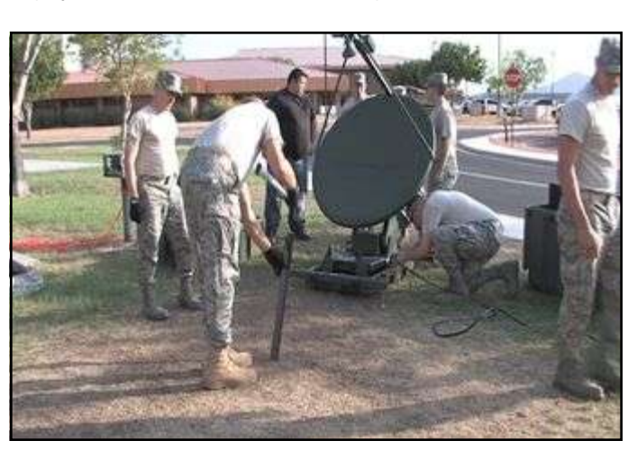
Ariz. Guardsmen assemble communication equipment as part of deploying the JISCC, July. 28, at Phoenix Sky Harbor Air National Guard Base. The JISCC bridges multiple communication gaps and opens the lines of communication between military and local agencies.

The system has an array of computer and communications equipment and comes with its own tent. However, the system can also be set up inside a standing structure. The focal point of the system is a 33-foot antenna. It gives the system capabilities to communicate over high frequency, ultra high frequency, very high frequency and 800 megahertz channels. This capability is vital in the aftermath of a disaster. Among other capabilities, the JISCC can link an incident site anywhere in the nation to state and national headquarters. It also has the capability to connect to cellular telephones and home telephones; it make conflicting communication systems compatible.