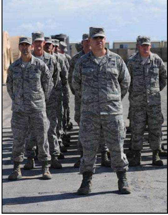
Airmen with the Arizona Air National Guard 's 161st Air Refueling Wing stand at parade rest during a change of command ceremony, July 28.