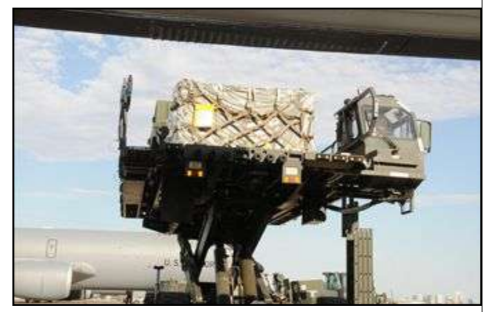
PHOENIX, AZ -- A K-Loader is guided closer to load a KC-135R. Personnel with 161st Aerial Port Flight conducted training at the same time a real world mission is preparing at Phoenix Sky Harbor Air National Guard Base, July 11, 2010.

Once the cargo is ready for shipment Aerial Port completes a joint inspection with the unit the equipment belongs to. During this inspection they confirm the weight of the items and check to make sure the dimensions are configured for the aircraft it will be loaded upon. Servicemembers from Aerial Port then inspect the cargo to make sure it complies with Air Transportation shipment regulations, such as making sure the correct tiedown restraints are being used. They also make sure that if there is any HAZMAT material that the proper paperwork is filed and a placard is visibly on the