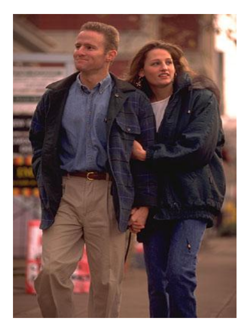
COUPLES ENRICHMENT RETREAT TBA

FAMILY WELLNESS RETREAT (Strong Bonds) July 23-25, 2010