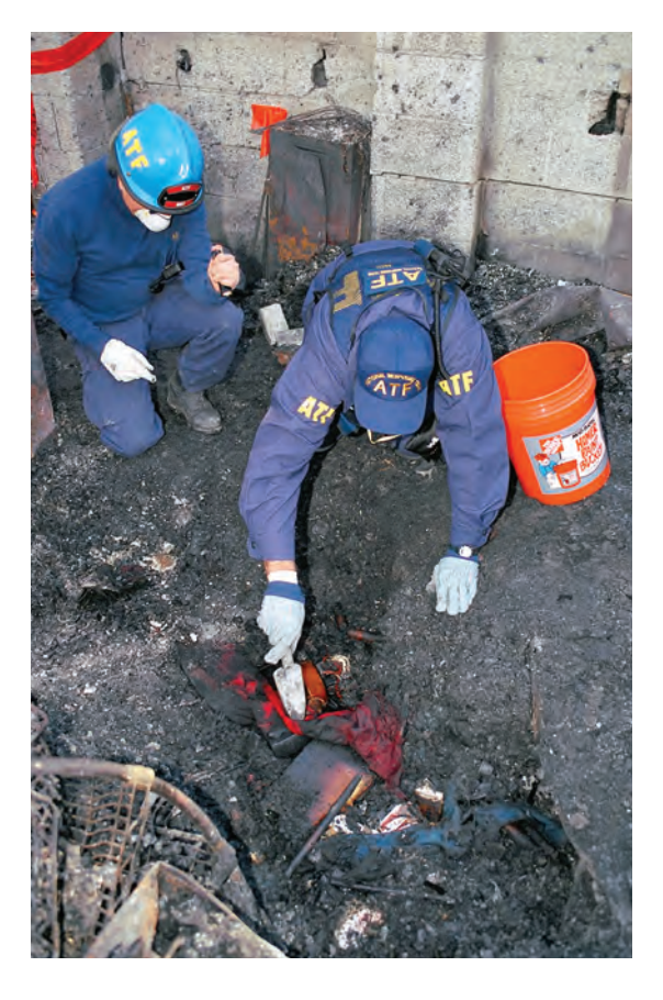
Our six strategic goals, the challenges and threats to which they respond, and our corresponding programs, strategic objectives, and strategies are described on the following pages.

BUREAU OF ALCOHOL, TOBACCO, FIREARMS AND EXPLOSIVES