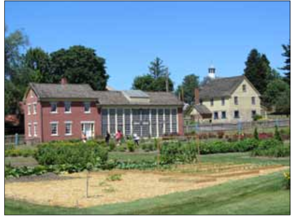
Zoar Village is threatened by proposed construction related to the Dover Dam flood management project.

Currently, alternative solutions to solve the seepage problem are being proposed, evaluated, and are under consultation. Once USACE has reached the