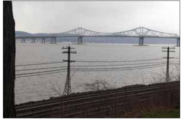
The Tappan Zee Bridge, seen spanning the Hudson River, will be replaced by two new structures.

Section 106 consultation on the new project was initiated by FHWA in December 2011. Section 106