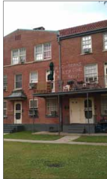
Portion of the Iberville Public Housing Complex

It is a unique resource. Iberville is one of the last remaining traditional public housing structures in New Orleans—most of the others were demolished post-Katrina. It has an aesthetic architectural style and is well-built. However, project proponents believe selective demolition is necessary to allow for the necessary upgrades in electrical, heating and cooling systems,