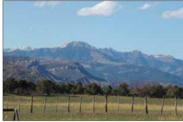
Marie J. Webb Ranch with views of the San Juan Mountains. The new route will cut a deep trench through the field in the foreground.

In reviewing alternatives, CDOT identified a preferred route through the Webb Ranch and the Craig-Limousin Ranch. No buildings or structures will be lost, and the project will physically impact only the far western edge of the Craig-Limousin Ranch. But the project will route the new four-lane highway across Florida Mesa through 41 acres of the 515-acre