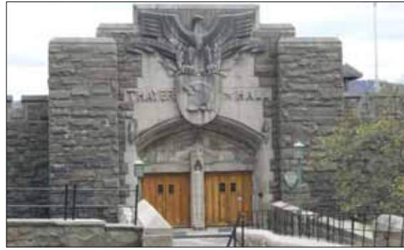
Thayer Hall

Among consulting parties in development of this PA are, in addition to USAG-WP and the ACHP, the Army Environmental Command, Department of the Army (Army); National Park Service; and the New York State Historic Preservation Office (SHPO). The ACHP has begun to focus its involvement with individual Army installations regarding the development and revisions to real property master plans in accordance with the newly released Department of Defense (DoD) Instruction