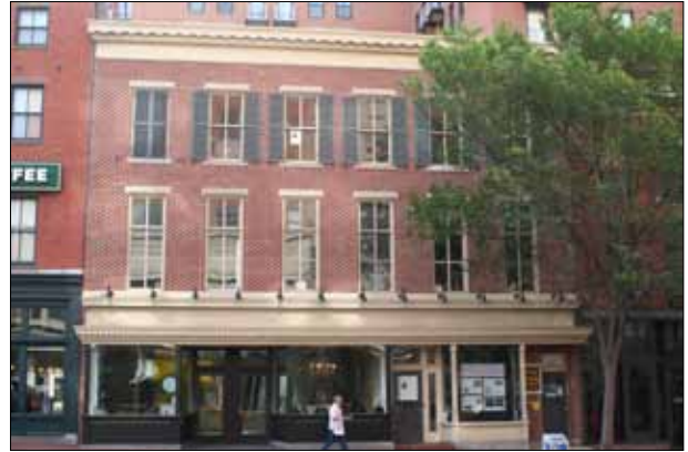
Contemporary view of the exterior of the building containing the historic third floor Clara Barton residence and Missing Soldiers Office.

The new museum will contribute to GSA’s compliance with the Preserve America program (Executive Order 13287), which calls for federal agencies to support heritage tourism. The NMCWM and future museum visitors will benefit from GSA’s extensive stewardship and research efforts. NMCWM has tentative plans to open a welcome center on the site in late 2012, and the entire museum in 2013.