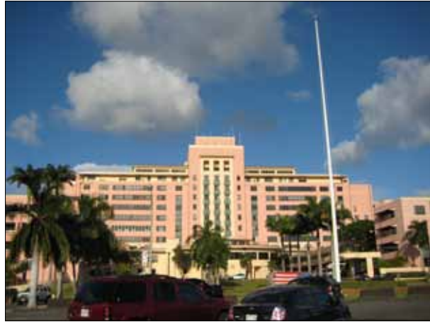
Tripler Army Medical Center, Honolulu, Hawaii

The MOA ensures that the Department of Veterans Affairs (VA) will construct a facility that is architecturally compatible with the historically significant medical facility. Sympathetic design elements will include appropriate paint colors and exterior finishes, roof profile and materials, and compatible windows and doors. Though the general location of the PTSD facility is fixed by both clinical requirements and the TAMC's