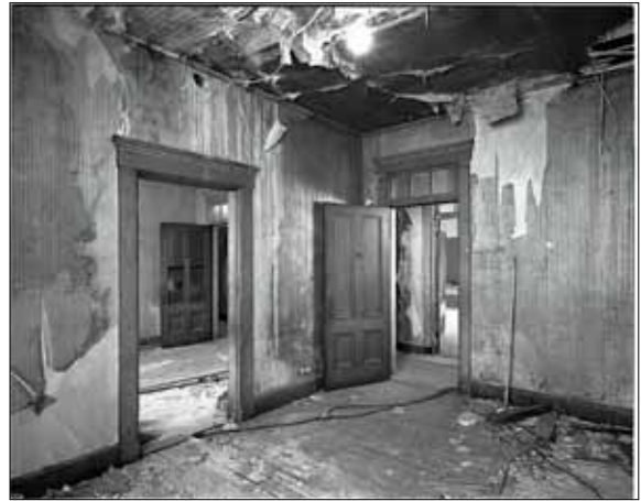
Original remaining materials, Clara Barton's diaries, office records, and photographs of the other temporary quarters where she supervised disaster relief efforts will inform the NMCWM's selective restoration and curation efforts at the new museum.

In 1996, PADC's real estate holdings were transferred