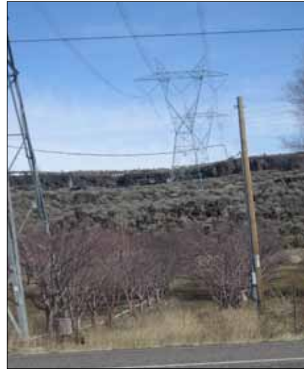
A 500 kV transmission line crosses remnants of an orchard.

Another challenge on all transmission lines is effectively addressing indirect effects, such as visual, atmospheric, and audible elements that diminish the integrity of the characteristics that make the property eligible for the National Register. For Gateway West, this included defining an APE for indirect effects that extends for five miles or to the visual horizon, whichever is closer, on either side of the proposed alternatives. The stipulations of the PA include the use of BLM's Visual Contract Ratings and potential photo simulations to determine the visual effects on all historic properties, and particularly on the historic trails. Cumulative effects