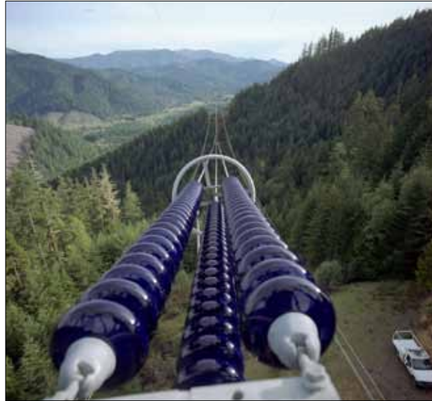
Birdseye view of insulators and transmission lines

In addition to the agencies noted above, also participating were the Wyoming State Historic Preservation Officer (SHPO); the Idaho SHPO; the Idaho Power Company and Rocky Mountain Power (proponents); and the Alliance for Historic Wyoming. The BLM is conducting government-to-government consultations with the Shoshone-Paiute Tribes, the Shoshone-Bannock Tribes, the Ute Indian Tribe of the Uintah and Ouray Reservation, the