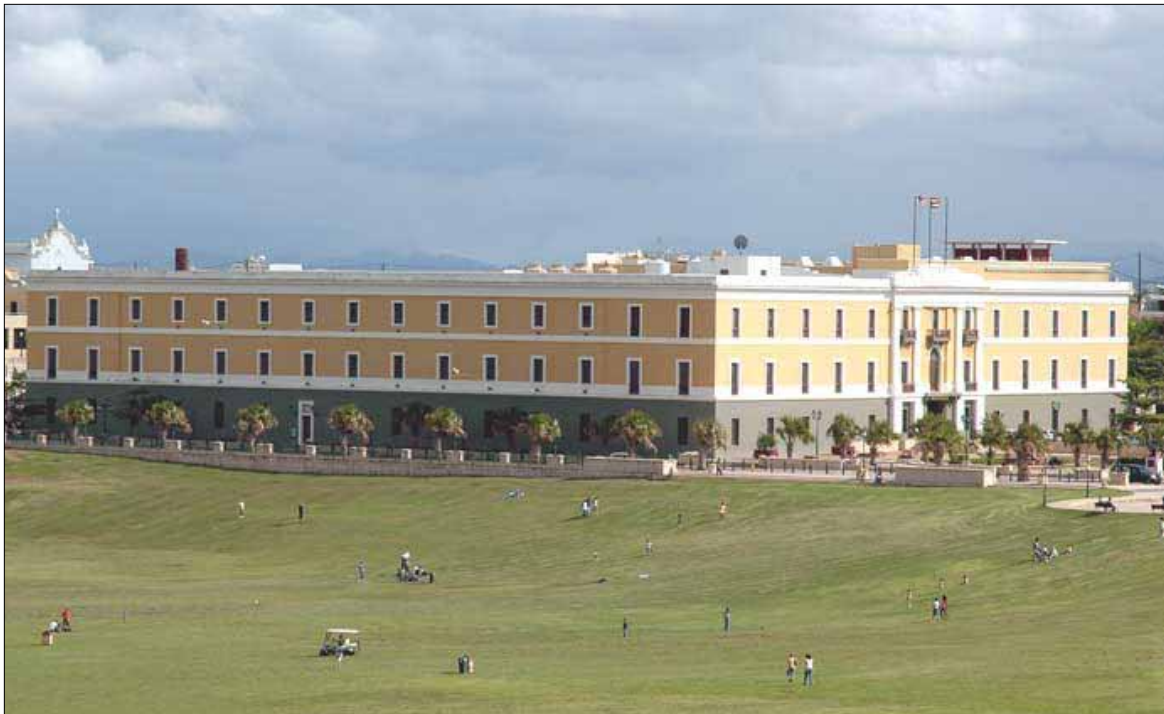
Ballaja Barracks is sited near El Morro in San Juan, Puerto Rico.

In addition to the installation of the photovoltaic modules and cells, a green roof has been incorporated on the rooftop to further enhance the approach of the SHPO to introduce green and sustainability components to this historic building to ensure its longevity. In addition, a new HVAC system was installed for the building, utilizing existing storage facilities while replacing cooling tanks.