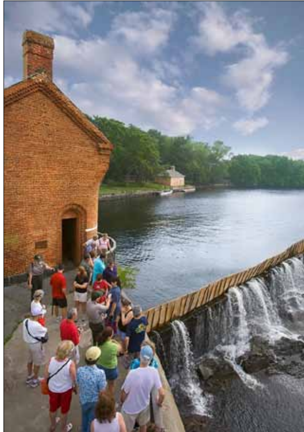
Pawtucket Dam at Pawtucket Falls showing flashboard and pin system with NPS visitors, east side of dam

All consulting parties, including the project proponent, appear genuinely focused on developing an alternative that would minimize adverse effects to the historic properties and achieve the goals of the undertaking. Based on the discussions, it appears that a combined technological approach, utilizing 19th century and modern technology, could provide a reliable means to maintain a stable operating pool level that would also be responsive to high water and flood conditions. Rehabilitation of the flashboard system along at least a portion of the dam so that it better approximates the original 19th century design would serve to restore that portion of the dam more closely to its 19th century appearance and function and also contribute to greater reliability in control of water levels. Such an achievement would be a preferred preservation outcome. The LNHP and Boott have agreed to coordinate further to investigate the details of potential modifications and alternatives to the current proposal, including the hybrid of modern and 19th century technology proposed during the meeting.