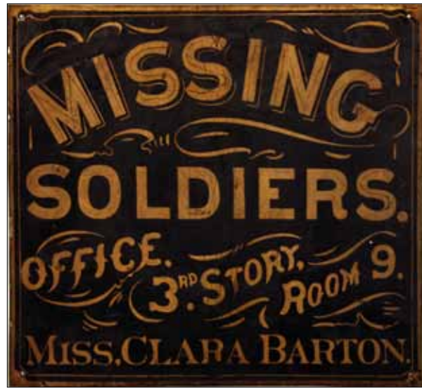
In 1997, a GSA employee discovered artifacts—including this original hand-painted sign—at a building slated for disposal and private development.

In 2000, pursuant to Section 106, an MOA among GSA, the ACHP, NCPC, and SHPO was executed, and in 2001 a related Declaration of Easements and Covenants for the Clara Barton Building was executed with GSA's private development partner,