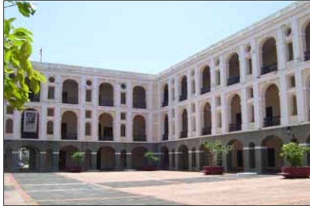
Interior patio of the Ballaja Barracks

Following its use as barracks, the building functioned as a hospital while owned by the United States federal government. In 1976, the government of Puerto Rico acquired the Ballaja Infantry Barracks from the federal government by way of a transfer with a commitment to restore and use the building for