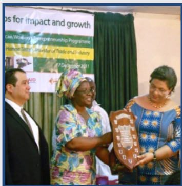
Photo from the launch of the Ghanaian AWEP chapter

AWEP continues to flourish. Just this month, Nigeria and Ghana launched AWEP chapters. Congratulations!