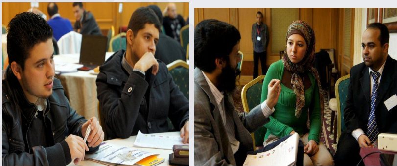
Entrepreneurs in Alexandria getting mentored

February 18, ECP and YES Egypt organized a speed mentoring event in Alexandria. A total of 54 entrepreneurs (38 teams) met with 16 mentors for a total of 130 mentoring sessions. Please refer to the following link for pictures of the event: https://www.facebook.com/#!/media/set/?set=a.216228415142889.43692.149871171778614&type=3