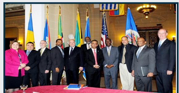
Officials on hand in Washington at the announcement of the project