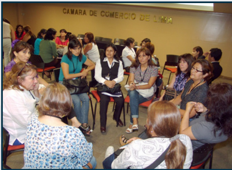
Peruvian women business owners forming a consortium at the Vendor Opportunity Forum, March 27, 2012