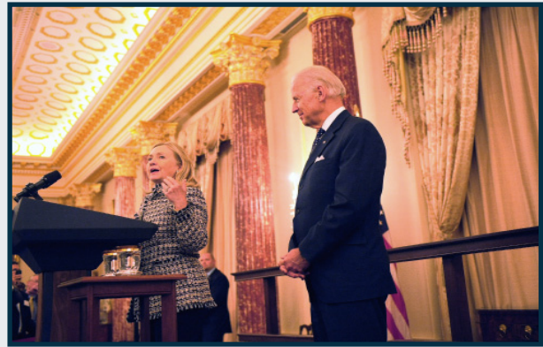
Secretary Clinton and Vice President Biden highlighted America’s commitment to maintaining competitiveness and supporting U.S. companies.