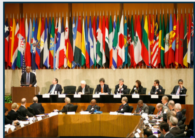
U.S. Trade Representative Ron Kirk, discussed U.S. broad trade agenda, including the National Export Initiative, U.S. support for Russia’s recent accession to the WTO, and the pending implementation of the bilateral trade agreements with Korea, Colombia and Panama.