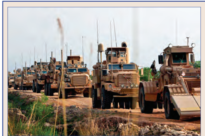
U.S. Marines stage their vehicles before beginning a route-clearing mission near Marja in Afghanistan's Helmand province, April 9, 2011. The Marines, assigned to Bravo Company 1st Tank Battalion, have added route-clearing support to their mission.

To cope with such challenges, some energy supplies are re-routed or delivered by air to minimize the risks to convoys and ensure supply. According to USTRANSCOM, air delivery is 10 times as expensive as ground delivery. 13 In addition to the costs and strategic challenges such alternatives may entail, the United States may face future adversaries armed with precision weapons even more capable than those of current foes of targeting ground, sea, air, space, or cyber lines of communication.