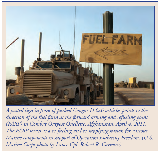
A posted sign in front of parked Cougar H 6x6 vehicles points the direction of the fuel farm at the forward arming and refueling point (FARP) in Combat Outpost Ouellette, Afghanistan, April 4, 2011. The FARP serves as a re-fueling and re-supplying station for various Marine components in support of Operation Enduring Freedom.

Through the Defense Logistics Agency-Energy (DLA-Energy), military logistics forces, and private sector partners, the DoD goes to great lengths to ensure U.S. forces have a steady supply of fuel for current operations. By the end of 2010, DLA-Energy was moving 40 million gallons of fuel per month into Afghanistan alone. That commitment to supplying the force with fuel will continue. At the same time, the Department will develop and deploy alternative energy that can remove some of the burden from these supply lines, with a focus on energy that can be generated or procured locally or regionally near deployments. For example, Special Operations Forces in northern Afghanistan and a company of Marines recently deployed to Helmand Province, Afghanistan, are evaluating solar-powered electricity generation capabilities. 18 The Navy is looking into waste-to-energy technologies that can be installed on ships. More broadly, the Department must incorporate improvements in operational