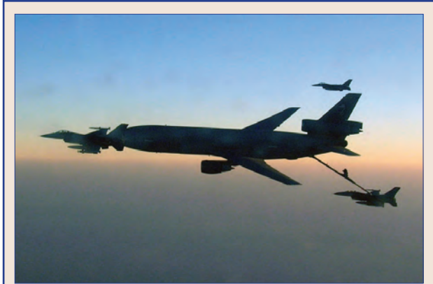
A KC-10 Extender from the 908th Expeditionary Air Refueling Squadron refuels F-16 Fighting Falcons Feb. 1, 2010, over Afghanistan, during Operation Enduring Freedom air refueling operations.

The Department's top mission priority today is to support current operations, and DoD Components should focus their operational energy investments accordingly. The Department also has a duty to ensure the future security of the Nation, making planning and force development an important operational energy focus, as well. The Department has an interest in long-term national energy security and should take steps to work with other Federal agencies and the private sector to diversify and secure fuel supplies. Finally, operational energy is an important tool for strengthening U.S. Alliances and partnerships with other nations, a key strategic goal for the Nation.