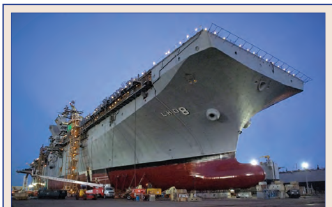
A bow view of the USS Makin Island (LHD 8) under construction in Pascagoula, Miss. The USS Makin Island is the Navy's first amphibious assault ship equipped with an all electric auxiliary system and a hybrid gas turbine - electric propulsion system. On her maiden voyage, her hybrid drive saved approximately one million gallons of fuel and is expected to save more than $250 million over her lifecycle.

Going forward, decisions regarding U.S. force structure, posture, and strategy will have profound implications for energy demand, the ability to assure delivery of energy to forces operating in contested regions, and the cost of operations.