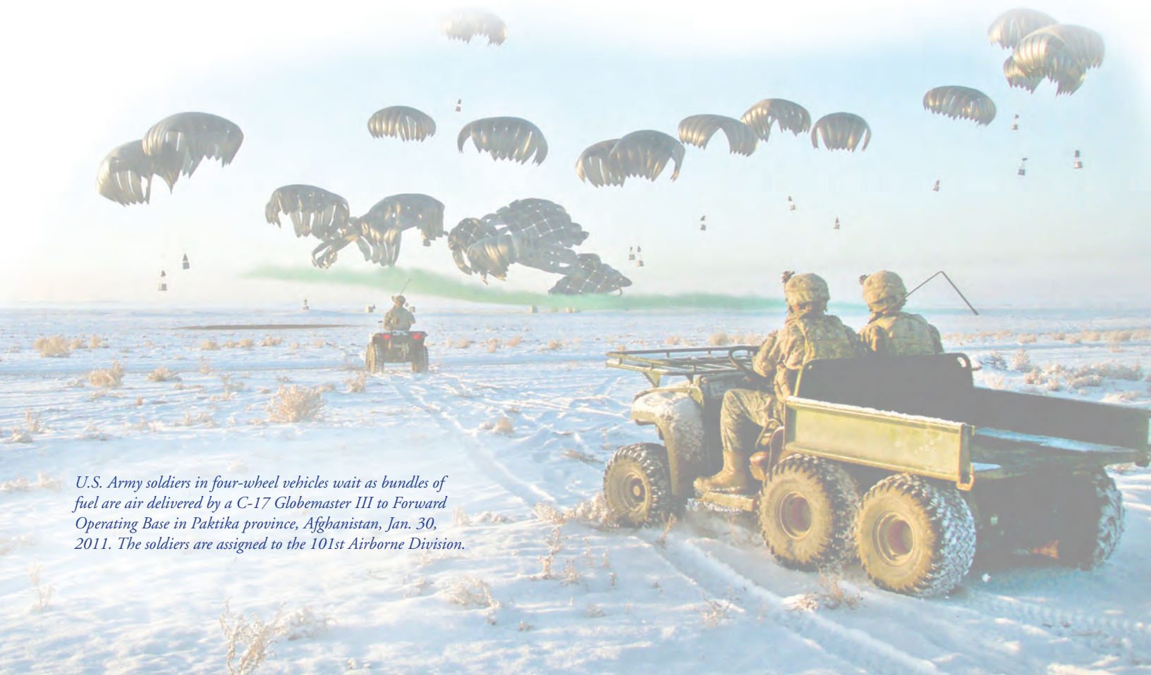
U.S. Army soldiers in four-wheel vehicles wait as bundles of fuel are air delivered by a C-17 Globemaster III to Forward Operating Base in Paktika province, Afghanistan, Jan. 30, 2011. The soldiers are assigned to the 101st Airborne Division.

This inaugural DoD Operational Energy Strategy is intended to give DoD Components a common direction and provide overarching guidance. In implementing this Strategy, the Department will seek common goals, programs, and policies wherever possible, while allowing for flexibility and differentiation across military roles and missions as appropriate. Subsequent updates of the Strategy and implementation plan will include specific performance metrics as the Department gains a more detailed understanding of current and anticipated operational energy consumption.