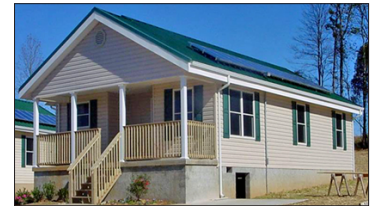
Solar energy provided 2,260 kWh per year from this second house built in 2004. Solar system costs dropped from $22K for the first house to $15K for the second and third house one year later.

air using a heat transfer fluid pumped through pipes laid 5 feet underground where the temperatures stay about 55 degrees in winter and 70 degrees in summer. High-performance double-pane, low-emissivity windows are located on the homes' south facing walls under deep overhangs to increase day light while cutting unwanted summertime solar heat gain. Heat gain is also cut through infrared reflective paints on the exterior walls and reflective roofing materials. A year around mechanical ventilation system maintains much better than average indoor air quality. Energy Star appliances and compact fluorescent lighting adds to the energy savings.