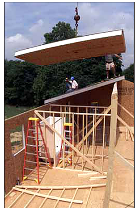
All five houses use structural insulated panels (SIP) for super efficient wall and roof construction.

Energy efficiency and clean, renewable energy will mean a stronger economy, a cleaner environment, and greater energy independence for America. Working with a wide array of state, community, industry, utility and university partners, the U.S. Department of Energy's Office of Energy Efficiency and Renewable Energy invests in a diverse portfolio of energy technologies.