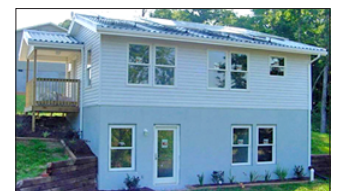
The fourth house, at 1,200 square feet with a walk-in lower level.

Solar system: 12-165W multicrystal silicon PV modules-12.68% efficiency, 1.98 kWp or 20-110W polycrystalline 2.2 kWp