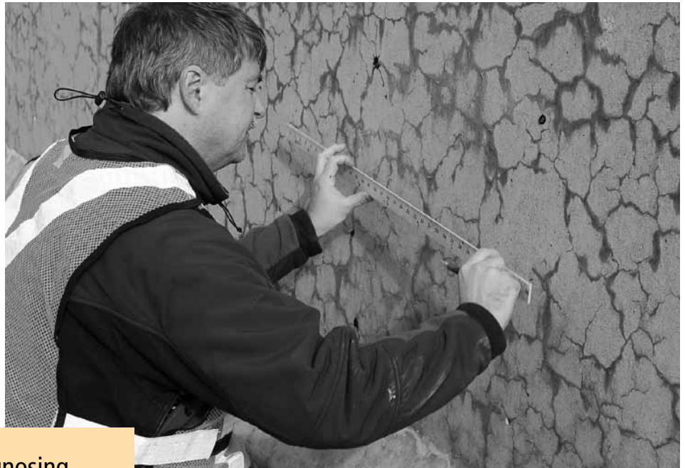
A concrete median barrier affected by ASR is examined.

Diagnosing ASR begins with a condition survey to evaluate the presence and severity of distress.