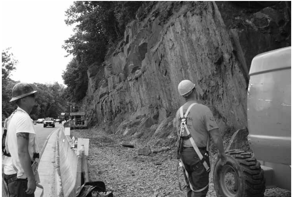
A rock cut slope on the George Washington Memorial Parkway in Arlington, VA.