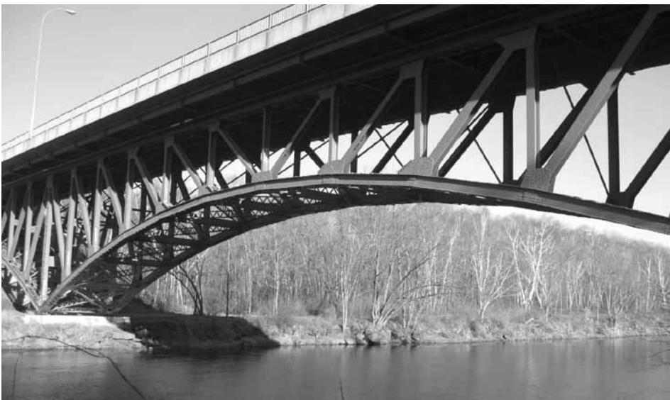
FHWA's Long-Term Bridge Performance (LTBP) program is conducting pilot studies at seven bridges across the country, including a bridge in Sandstone, MN, that carries State Road 123 over the Kettle River.

Selected pilot bridges include one that carries Southbound U.S. Route 15 over Interstate 66 in Prince William County, Virginia. Constructed in 1979, this two-span steel haunched girder bridge has a cast-in-place concrete deck and carries an AADT of 16,500 vehicles, with six percent trucks. Both the steel superstructure and the concrete deck are showing a significant degree of deterioration. The Minnesota pilot bridge, meanwhile, carries State Road 123 over the Kettle River in the town of Sandstone. Constructed in 1948, the steel deck truss bridge carries an AADT of 2,050, with eight percent trucks. And in New Jersey, the pilot