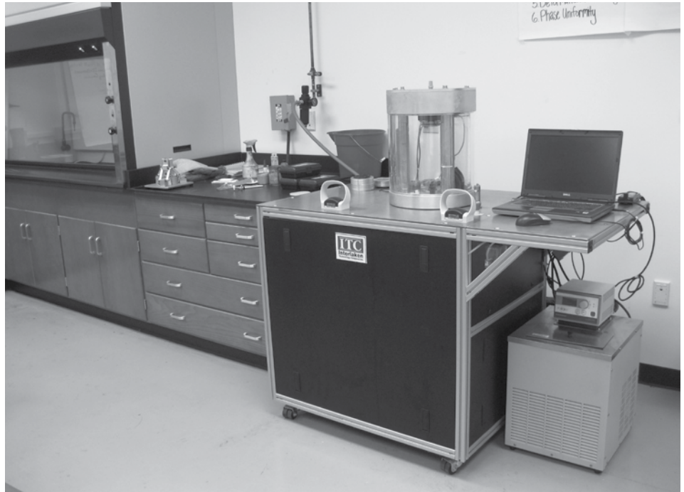
The asphalt mixture performance tester can subject a compacted asphalt mixture specimen to cyclic loading over a range of temperatures and frequencies.

Aimed at pavement and materials engineers and technicians, the 2-day course will focus on using the AMPT to perform standard tests to measure the dynamic modulus and flow number of asphalt mixtures. Data from these tests can then be directly input into the American Association of State Highway and Transportation Officials' Mechanistic-Empirical Pavement Design Guide .