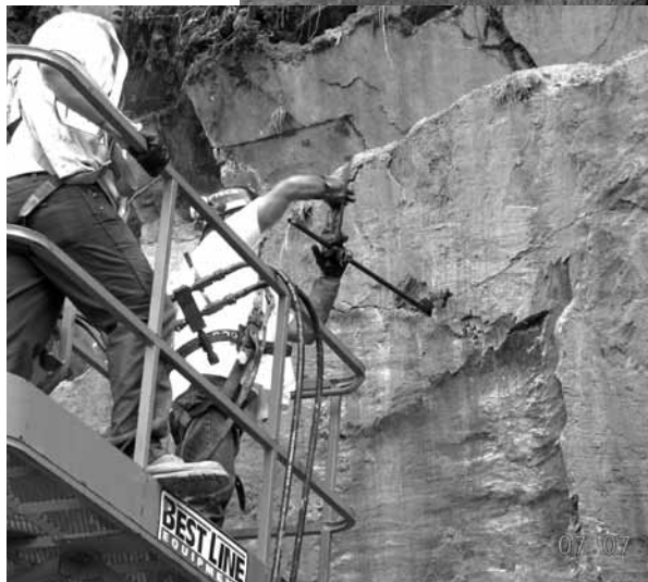
Left: Drilled holes are prepared for injection of polyurethane resin or “rock glue.”