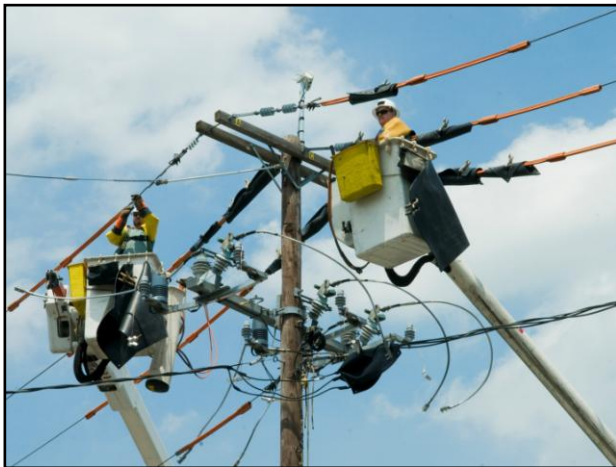
PPL linemen installing a smart switch

Using automated capacitor banks and reconfigured substations, the DMS implements voltage control strategies. As a result, energy savings can be expected in the form of reduced customer energy use and lower distribution line losses. “Any customer system with a motor, such as heat pumps, air conditioners and refrigerators, is expected to save energy,” Godorov says.