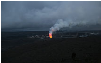
SO 2 Plume