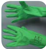
Examples of Nitrile Gloves