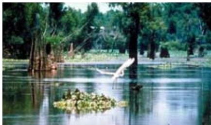
Atchafalaya Basin Scene