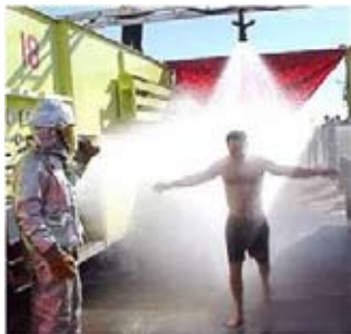
Mass decon: Photo courtesy IUOE