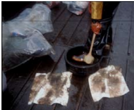
Field decon boot wash