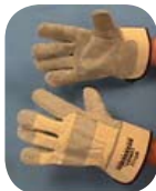
Examples of Leather Gloves