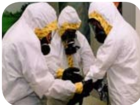
Level C PPE with Coated Protective splash suit and APR respirators