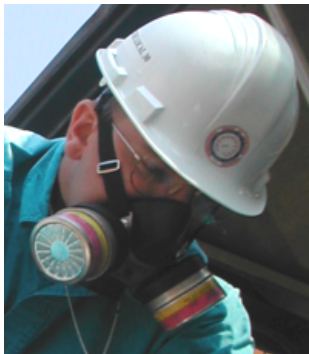
½ face respirator with P-100/OV/AG cartridges

If in doubt about respirators, see your Supervisor!