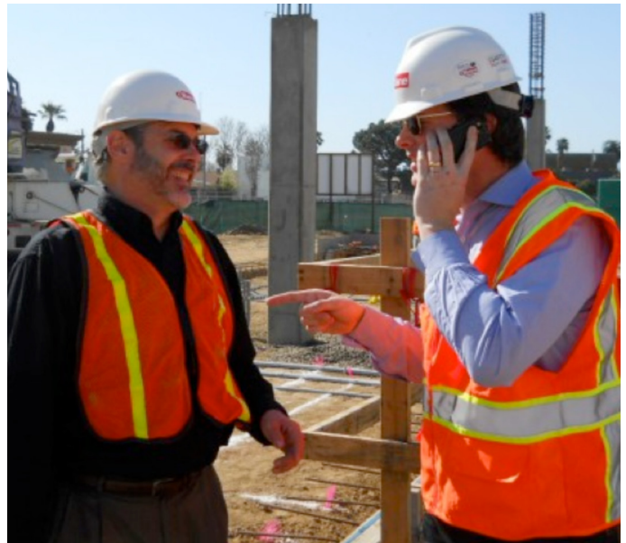
Bakersfield Courthouse Telework