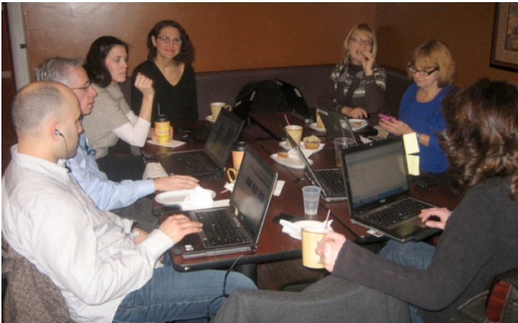
Regional GSA Account Management Team embraced GSA Telework Week by meeting as a group to take a required training course