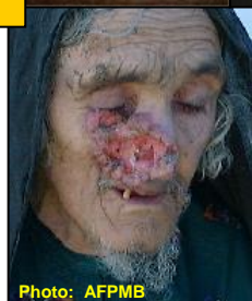
Mucocutaneous leishmaniasis