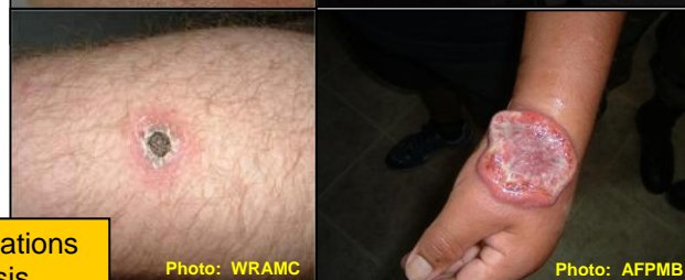
Physical manifestations of leishmaniasis