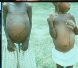
Visceral leishmaniasis