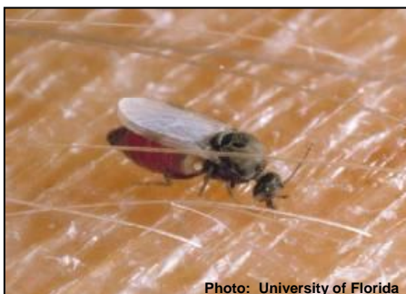
Culicoides Sand Fly (Does NOT transmit Leishmania)