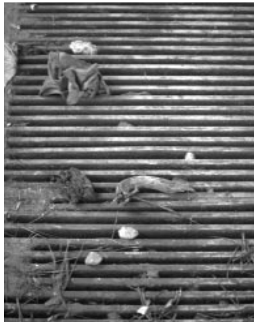
Impervious surfaces contribute to urban runoff.

Streets, parking lots, rooftops, and other impervious surfaces all contribute to urban runoff. Parking lots generate almost 16 times as much runoff as an undeveloped meadow. 76 As the amount of paved and covered surfaces within a watershed grows, stream beds are widened, flooding is increased, and groundwater recharge is reduced. As the amount of impervious surface within a watershed rises above 10 percent, impacts on local water