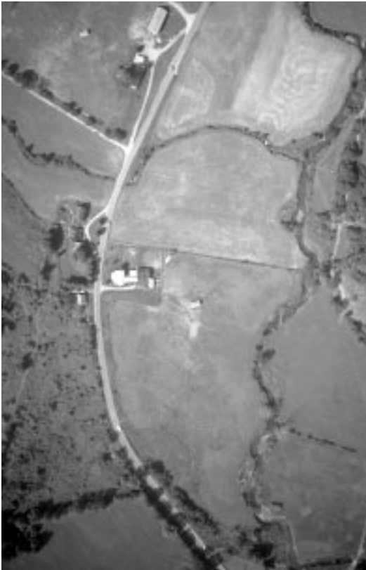
Preservation of rural character is a challenge.

The following three case studies—Lancaster County, Pennsylvania; Kansas City, Missouri; and Portland, Oregon—are representative of the experiences of communities across the country. The first two case studies show the unanticipated drawbacks of rapid growth. The third case study shows that with smarter growth, new investments add value to existing communities.