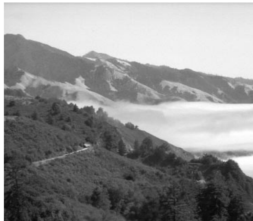
Undeveloped fringe of an urban region, San Francisco Bay Area.

The New Jersey redevelopment plan also showed that with strategic protection of the most sensitive environmental areas, 29,000 acres of habitat and sensitive land could be preserved while still accommodating all the necessary new development. 86 Small steps like this can go a long way. A 1995 Defenders of Wildlife study notes that habitat loss is the single factor most likely to cause extinction for thousands of plants and animals. 87