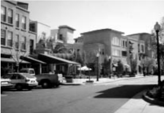
Redevelopment of an old Sears site in San Diego, California.

In communities across the nation, there is a growing concern that current development patterns—dominated by what some call “sprawl”—are no longer in the long-term interest of our cities, existing suburbs, small towns, rural communities, or wilderness areas. Though supportive of growth, communities are questioning the economic costs of abandoning infrastructure in the city, only to rebuild it further out. They are questioning the social costs of the mismatch between new employment locations in the suburbs and the available workforce in the city. They are questioning the wisdom of abandoning “brownfields” in older communities, eating up the open space and prime agricultural lands at the suburban fringe, and polluting the air of an entire region by driving farther to get places. Spurring the smart growth movement are demographic shifts, a strong environmental ethic, increased fiscal concerns, and more nuanced views of growth. The result is both a new demand and a new opportunity for smart growth.