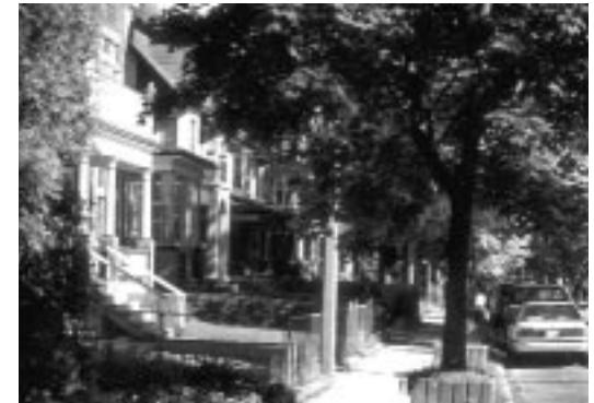
Home ownership is one of our shared national goals.

Good water and sewer service facilities are a prerequisite for development. Historically, the federal government has heavily subsidized the building of new water and sewer facilities with grant programs and revolving loan funds. Between 1972 and 1990, federal investments in wastewater systems, dispersed through the Construction Grants Program, totaled more than $60 billion. 45 These funds were available primarily for building new infrastructure