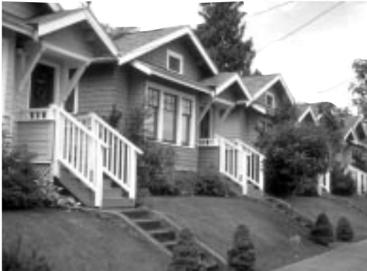
Smaller-lot houses provide housing diversity.