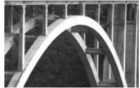
Operating and maintaining infrastructure account for a large share of local government costs.

Several questions still need to be answered. What is the effect of urban form on operations and maintenance? How do levels of service change? Given these uncertainties and in some cases conflicting findings, it is difficult to calculate density's ultimate impact. One thing is clear, however: today's service costs are likely to change with changing development and are therefore poor indicators of costs in the future.