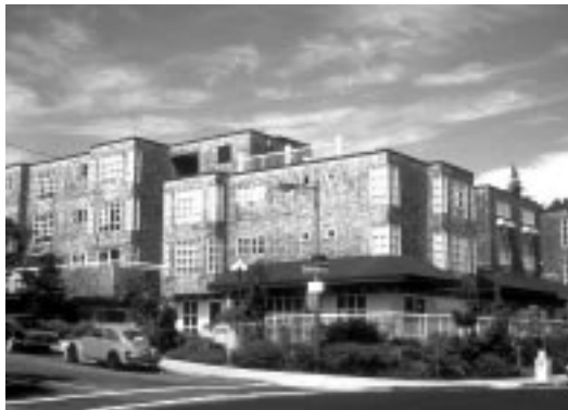
Mixed-use infill built on the site of an old gas station.

Two widespread alternative physical approaches are infill development and neotraditional development. These approaches tend to be of higher density with less emphasis on the automobile than conventional development patterns. These development patterns use urban design, architecture, and open space to shape higher densities into pleasing