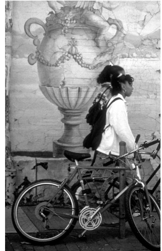
Community life in a pedestrian neighborhood of Toronto.

Clearly, growth and development can cut two ways. Growth can improve quality of life by adding services, creating opportunity, and enhancing access to amenities. It can also