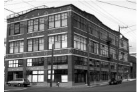
Historic preservation contributes housing to central cities.

As local public participation shows, development, and in many cases lack of development, greatly impact a community's quality of