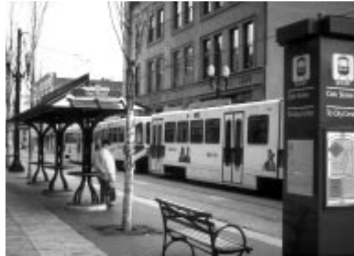
Portland, Oregon's MAX light-rail system

In 1970, Portland's downtown, like many across America, was dying. The problems were familiar and not unlike Kansas City's—urban decay, congestion, environmental deterioration, and a diminishing quality of life. However, Portland took a different route and made a conscious choice to direct growth and investment. Portland's regional residents elected a regional government with broad powers to implement a regional vision. Since then, Portland has been able to channel its growth in ways that preserve a high quality of life and accommodate an increasing population. Downtown employment has grown from