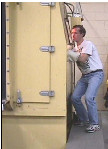
Figure 6: Blast machine use

Employees sandblast parts for up to 6 hours at a time. Employees place parts inside the blaster and then stand on a platform with their hands in gloves while watching through a window. The height of the windows and the openings for the gloves are not adjustable. The work heights of each of the four blast machines differ by as much as 12". Given the individual size differences among the employee population, operators are forced into extremely awkward postures for extended periods of time, as shown in figures 6 and 7. The duration of the blasting process may cause fatigue, muscle strain and cramping as well as cumulative trauma.