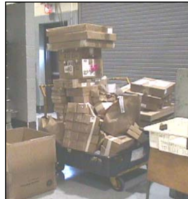
Figure 2: Cart of incoming boxes