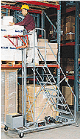
Moving Shelf Ladder