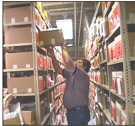
Figure 4: Employee reaching for parts