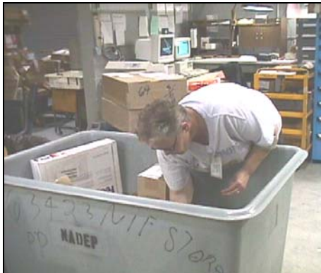
Figure 1: Emptying boxes from hamper

The storage area consists of rows of storage units and one wall of pallet shelves. There is currently not enough storage in this area and parts are stored in boxes on top of the storage units as shown in figure 3. These boxes are unsupported and pose a safety hazard. There is not enough room between the rows of storage units for the drawers to be pulled out. Employees must bend down to the floor and reach above shoulder height to access drawers of parts, as shown in figure 4. Bending and reaching can place strain on the back and upper extremities. The wall of pallet shelves stores larger boxes. Employees have to climb onto the shelves to reach boxes in the back. Higher shelves require the operator to climb up and down a ladder while carrying boxes, which increases the risk of falling. Figure 5 shows an employee twisting her torso to retrieve a box while maintaining her balance on the ladder. Lifting while twisting increases the stress placed upon the spine.