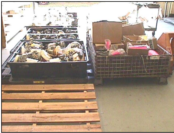
Figure 3: Pallets filling the dock