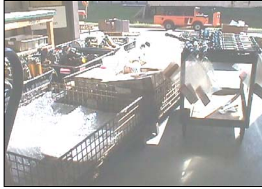
Figure 2: Wire baskets on pallets and cart for transporting parts