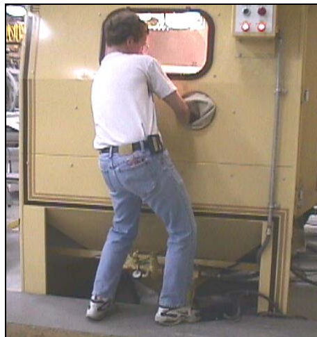
Figure 7: Blast machine use