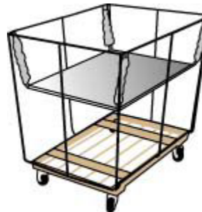
Elevated Basket Truck (The entire hamper elevates)