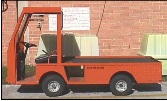
Figure 1: Buddha Truck