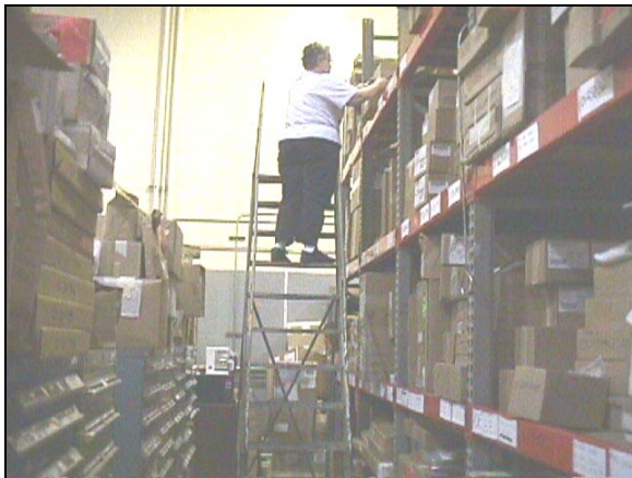
Figure 5: Employee reaching for box on upper shelf