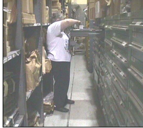
Figure 4: Reaching into drawer