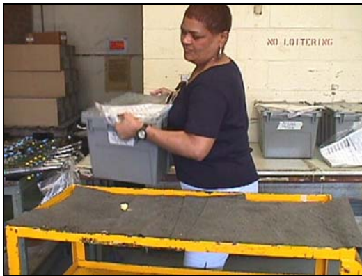
Figure 5: Employee loading a cart

Figure 5 shows an employee lifting a load from a table and twisting her torso to place the load on a cart behind her. Twisting while lifting increases the biomechanical loading of the spine. When using height adjustable carts, place the cart perpendicular to the table being unloaded and slide the part onto the cart.