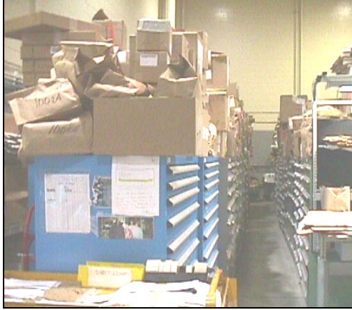
Figure 3: Boxes stored on top of shelving units