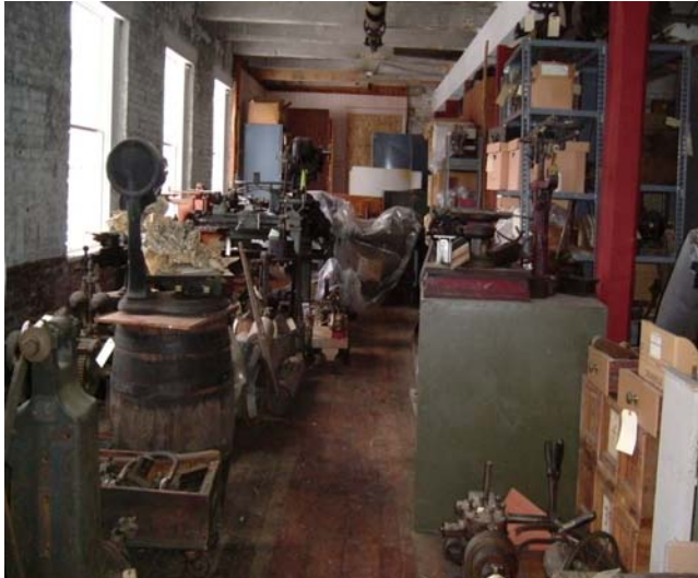
2 nd floor storage before – a chaotic jumble

Please refer to the graphs.pdf attachment for temperature and relative humidity data for exhibit and storage locations at all three sites.