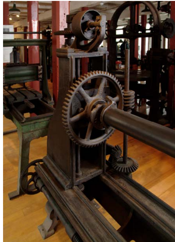
Main hall: early planer, left, horizontal boring mill, right