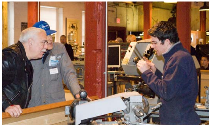
Student intern demonstrating in the working machine shop, main hall.

Mission Statement The American Precision Museum (APM) is a national center for the collection, preservation and interpretation of the history of precision manufacturing. Our mission is to enhance public understanding of the importance of precision manufacturing, the ingenuity and entrepreneurial spirit which drive it and its effect on our everyday lives. (2007-04-28)