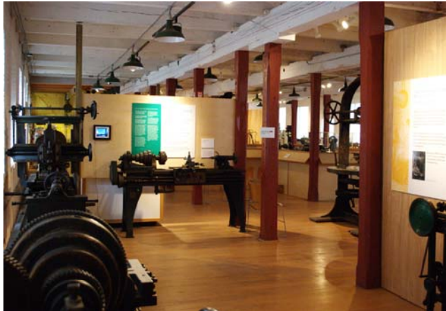
Muskets to Motorcars exhibit in main hall, armory 1 st floor

ideas for consistency and compatibility. The plans will be finalized to a level sufficient to seek implementation funding. The consultants will also assist in developing proposals for implementation.