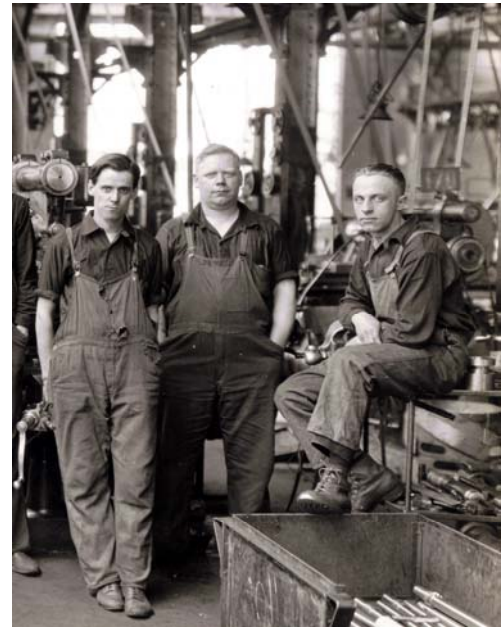
Jones and Lamson photograph collection

Related artifact collections are held at Smithsonian National Museum of American History.