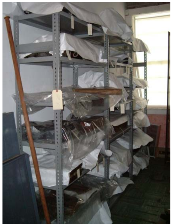
2 nd floor after – the typewriter collection

made of tyvek which allows moisture to pass through, window shades in exhibit and storage areas, and acid free folders and boxes as we proceed with rehousing. An emergency response plan has been in place since 2007, the year we also adopted Conservation Guidelines to discontinue the prior “Adopt a Machine” program in which volunteers “restored” machine artifacts. In 2008 we completed an upgrade to the security detection system. NEH Preservation Assistance grants helped us to set up a monitoring program in 2004 and we have been recording temperature and relative humidity conditions in 11 exhibit and storage areas in the three buildings. In 2006 we purchased rehousing materials, and in 2008 we brought conservator Ms. Clara Deck from The Henry Ford, Dearborn MI, to assess our priorities for the large metal artifacts and advise and train our staff and trustees in special techniques and materials for preventive conservation. (A report excerpt and photos are enclosed in strategic_plan_and_reports.pdf .) The