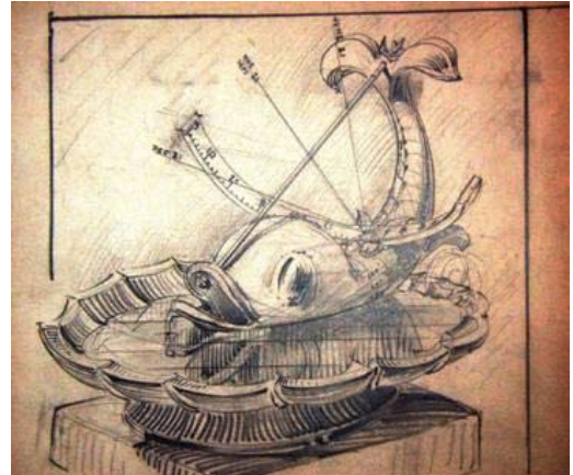
Drawing for a sundial by Russell W. Porter, a Springfield VT native who later worked on the Palomar telescope.

Archives and Library The archives collection is not processed however we have location tools including a physical inventory of all storage cartons and container units, and a three ring notebook organizing information about location, content, related collections, dates, formats, and more. We estimate we have 800 linear ft. of books, including several duplicate sets of bound volumes of both patent gazettes and American Machinist slated for removal, bringing the estimate of what we would keep to about 500 linear feet. We have a detailed inventory of about 70 rare and notable volumes. In Nov. 2007 an archivist from the Archives Center, National Museum of American History, Smithsonian, completed a survey of the archives with recommendations. A brief summary of the categories of holdings is included in the Strategic Plan excerpt.