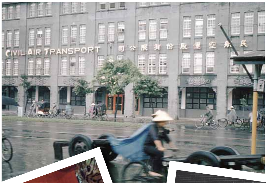
on the "Big Road"