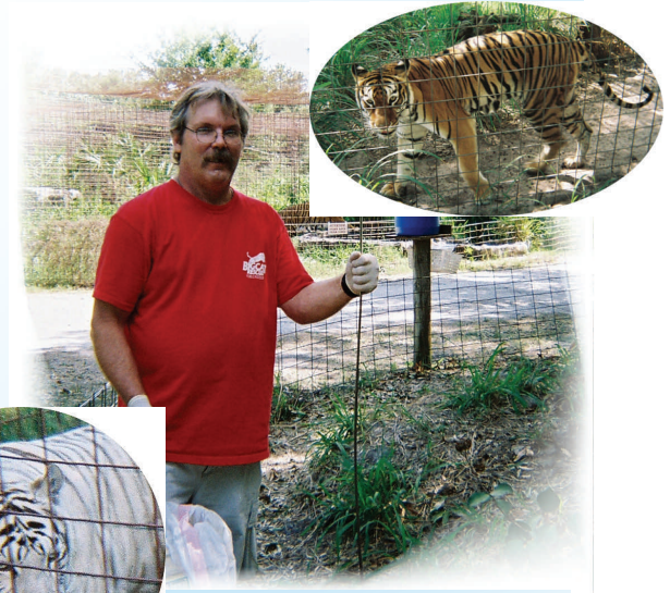
Volunteering at The Big Cat Rescue