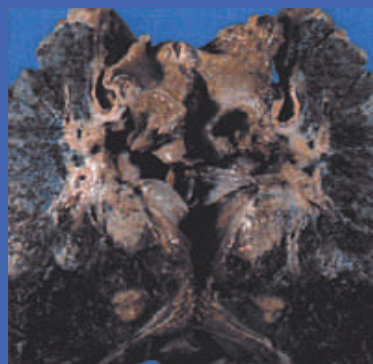
Dark, Smoker's Lung