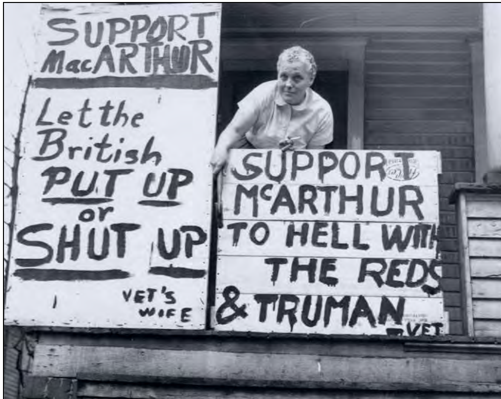
Protest of General MacArthur's Dismissal (, Youngstown Ohio, 13 Apr 51)