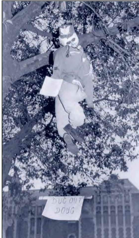
The General Hangs at Dawn (, Seattle, Washington, 13 Apr 51)

Truman announced the discharge of MacArthur, he told his White House staff that the general, like George B. McClellan in the 1860s, “worked with the minority to undercut the administration when there was a war on.” The next day, the New York Herald Tribune summarized the progression of events quite perceptively: “The most obvious fact about the dismissal of General MacArthur is that he virtually forced his own removal.” 30