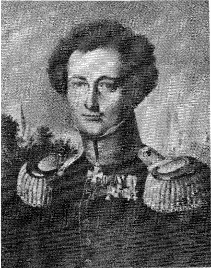
CARL VON CLAUSEWITZ