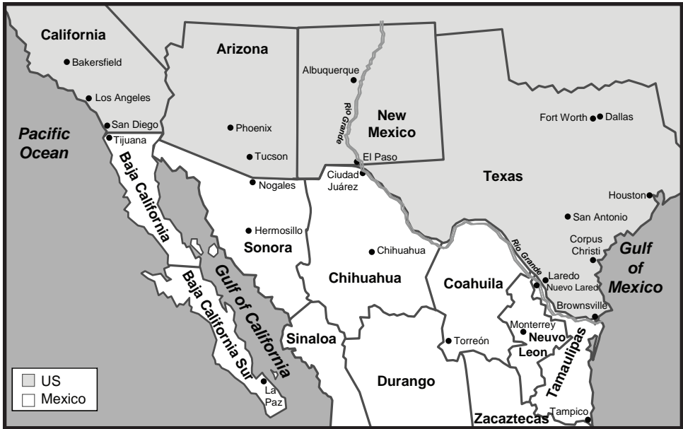
Map 5. The 2,000-Mile US-Mexican Border.

The top commanders soon realized that it would be nearly impossible to stop small raiding parties from penetrating across the border. According to US Army historian Andrew J. Birtle, Funston “responded to the crisis by spreading his troops out in penny packets in an effort to protect every small community. In doing so, he overextended his forces to such an extent that many outposts were too weak either to defend themselves or to hunt the bandits aggressively.” 26 To make matters worse, Washington refused to give Funston permission to cross into Mexico, even under the doctrine of hot pursuit. 27