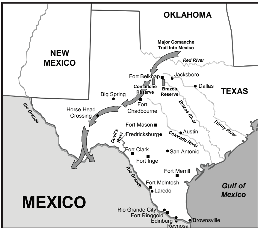
Map 3. Major Comanche Trail Into Mexico.

Although the US Army positioned 2,300 soldiers in the Department of Texas, only 600 manned the forts along the Rio Grande. It soon became apparent they could not possibly stop all the attacks. (See map 3.) Therefore, in 1852, the United States scrapped the provision in the Treaty of Guadalupe Hidalgo, which required them to defend Mexico against Indian attacks. 11 According to historian Clarence C. Clendenen, the provision was removed “because of the complete impossibility of carrying it out.” 12 He went on to point out, “In its efforts to cover the entire frontier in the early 1850s, the