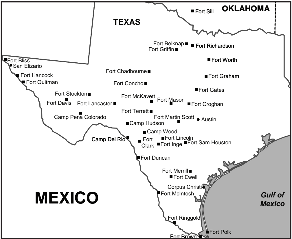
Map 4. Forts in Texas.

subpost, and a detachment of two to fifteen men held a picket station in most cases.