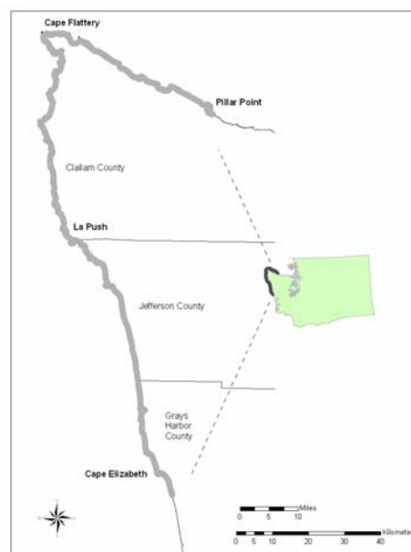
Figure 1. Approximate distribution of Washington sea otter stock.

In 2006, the distribution of the majority of the Washington sea otter stock ranged from Pillar Point in the Strait of Juan de Fuca, west to Cape Flattery and as far south as Cape Elizabeth on the outer Olympic Peninsula coast (Figure 1). However, scattered individuals (usually one or two individuals at a time) have been seen outside of this range. For example, sick or injured sea otters have come ashore as far south as Ocean Shores and repeated sightings have been reported in Grays Harbor and as far east as Port Townsend. Sightings around the San Juan Islands, near Deception Pass, off Dumas Bay, off the Nisqually River, and in southern Puget Sound near Squaxin and Hartstene Islands have also been reported. Several of the sea otters in Puget Sound became relatively "tame," and in some cases local residents were feeding these individuals and promoting their "friendly" behavior. The U. S. Fish and Wildlife Service (USFWS) and Washington Department of Fish and Wildlife (WDFW) intervened, to the extent necessary, when these individual sea otters exhibited behaviors that presented a danger to themselves or to human health and safety.