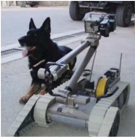
The Integrated Robotic Explosive Detection System is one of the Army's top 10 inventions for 2006. It was developed by U.S. Army Aviation and Missile Research, Development and Engineering Center, Redstone Arsenal, Ala.

by Soldiers from active-Army divisions and the U.S. Army Training and Doctrine Command according to three criteria: impact on Army capabilities, potential benefits outside the Army and inventiveness.