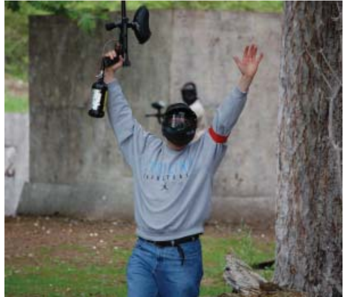
Seattle Battalion recruiters enjoyed some R&R as the battalion organized a paintball team-building event.