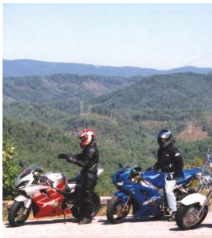
Today's sportbikes are more powerful and faster than anytime in history. They demand respect when riding.

All riders need to realize that it can happen to you. Yet, if you'll gain your experience on the road with safety in mind, you can enjoy a lifelong hobby that those on four wheels can only wonder about.