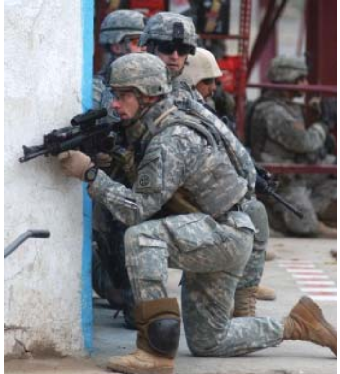
Psychological reactions are adaptive and life-preserving responses help keep Soldiers alive in combat.

For many Soldiers the transition home can be easy and smooth, and can happen with little notice or effort. While they may report sleep and anger problems, and feelings of emotional numbness soon after redeployment, these resolve within a few months. For some, the demands of recruiting duty, in combination with variables like intensity and frequency of combat or danger, number of deployments, physical injury, failing social and emotional support, and low self-confidence may complicate reintegration. These Soldiers may report a greater range of symptoms that last longer, are more intense, and have a greater