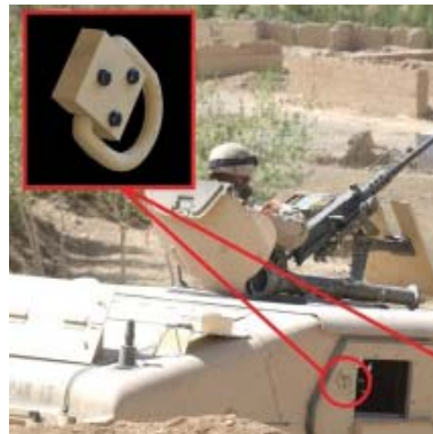
Aviation and Missile Research, Development and Engineering Center, Redstone Arsenal, Ala. The D-ring provides solid anchor points for the hooks of a tow strap, chain or cable to pull open damaged doors of an up-armored Humvee.

Another top 10 invention is the Humvee Crew Extraction D-ring pictured here. It was created by U.S. Army