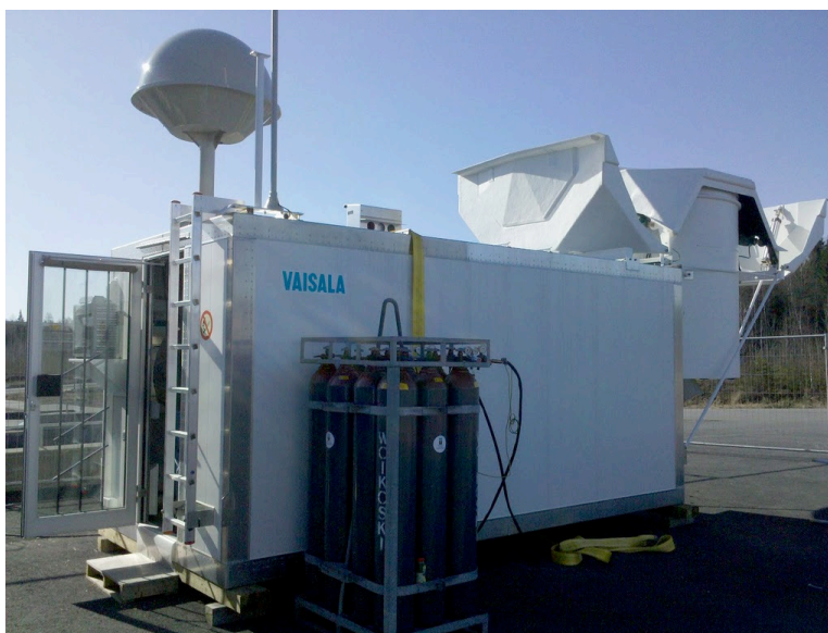
Figure 2. Vaisala AS13 Autosonde to be installed at NSA C1.

The Vaisala AS13 Autosonde will be installed at the NSA C1 site in Spring 2011 (see Figure 2). The Autosonde is an automatic weather balloon launcher that allows up to 24 radiosondes to be released without the need for personnel. The introduction of the Autosonde aims to increase the reliability of radiosonde launches in harsh environments, such as the NSA.