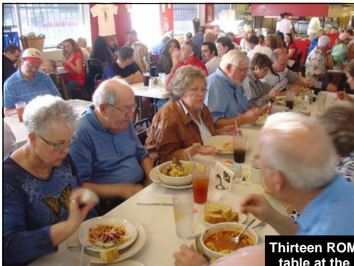
Thirteen ROMEOs filled a long table at the Chef Point Café.