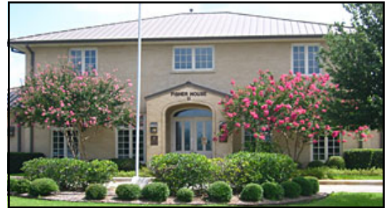
One of the three Fisher Houses at Lackland.

"Dedicated to our greatest national treasure ... our military service men and women and their loved ones."